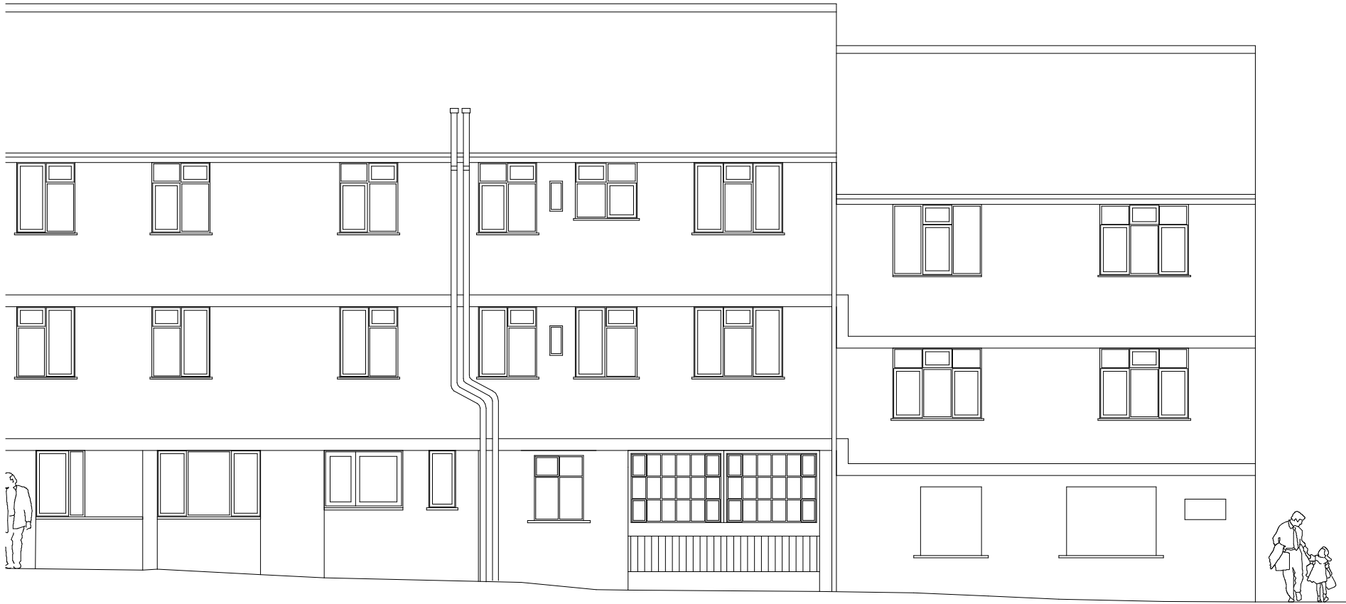
Existing South West Elevation