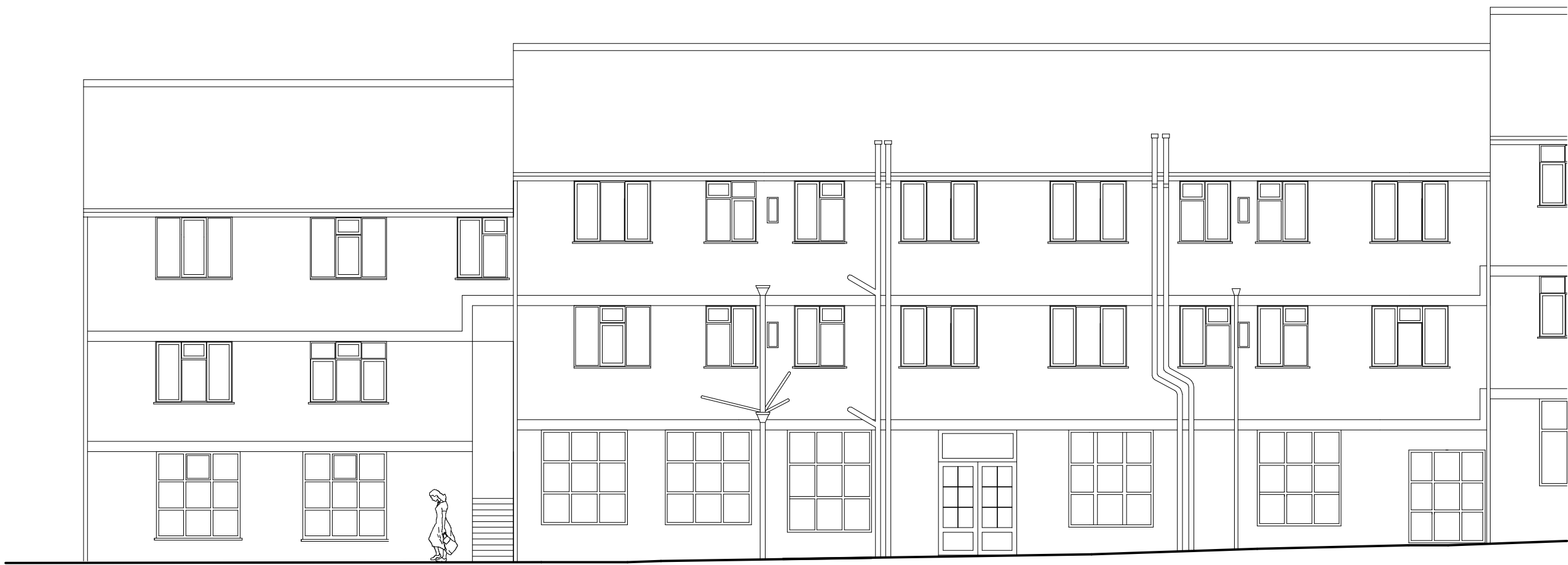
Existing North East Elevation