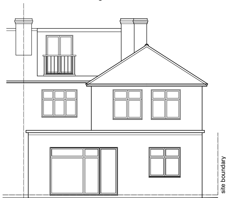
Proposed Rear Elevation alternative