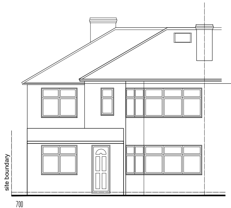
Proposed Front Elevation No visible change