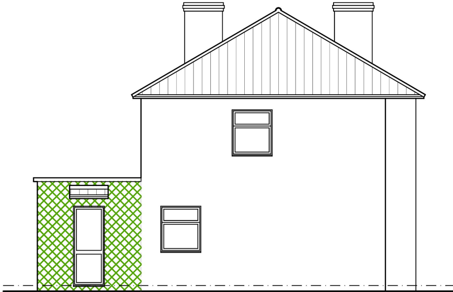
EXISTING RIGHT SIDE ELEVATION

Notes: - Do not scale from this drawing for any other purpose than planning. If no authorisation signature present drawing is for reference only. This drawing or part thereof is not to be copied without Agenda 21 Architects Studio written consent. Figured dimensions only are to be taken from this drawing. All dimensions to be checked on site by main contractor prior to commencement. All discrepancies to be reported to the Architect immediately. If in doubt, ask. © This drawing is the copyright of Agenda 21 Architects Studio Ltd.