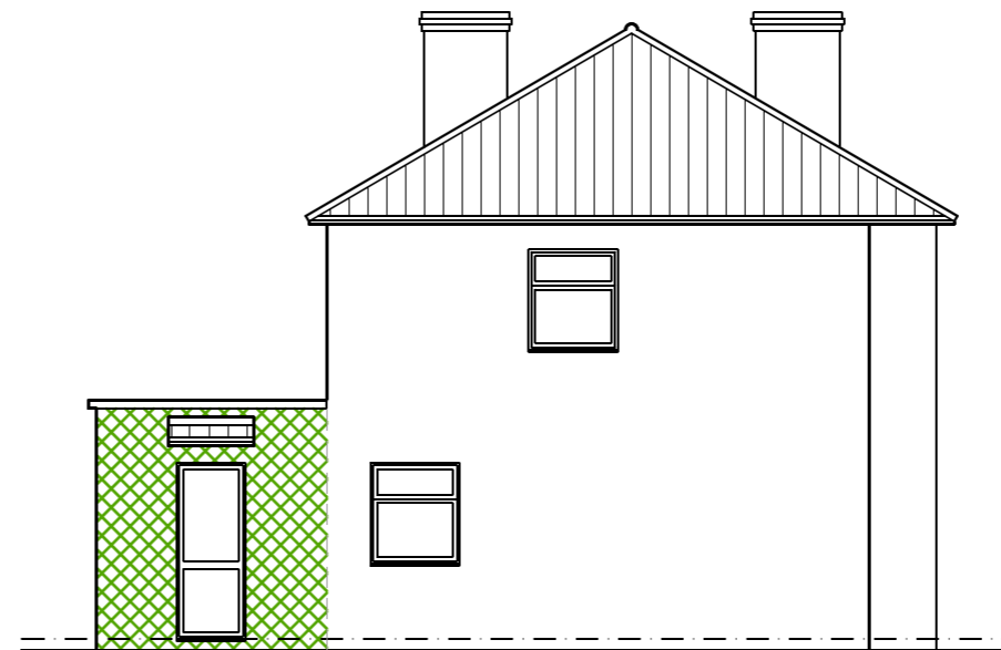
EXISTING RIGHT SIDE ELEVATION