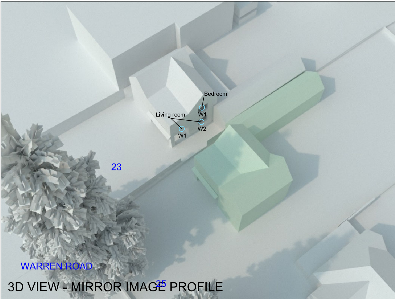
3D VIEW - MIRROR IMAGE PROFILE