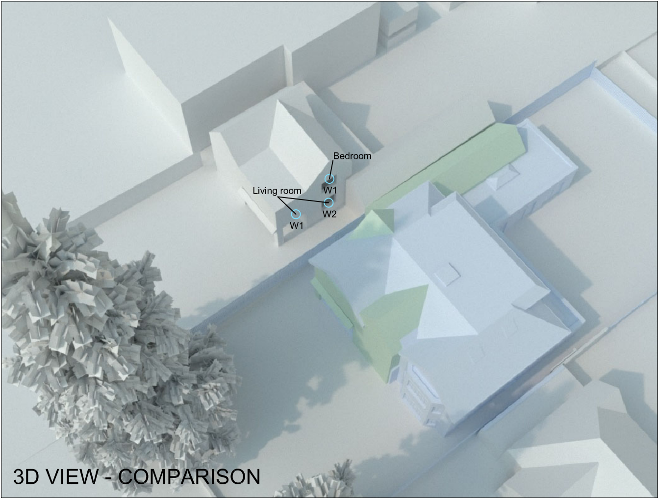
3D VIEW - COMPARISON

1) ALL DIMENSIONS TO BE CHECKED ON SITE AND NOT 2) DAYLIGHT AND SUNLIGHT SHALL BE INFORMED OF ANY DISCREPANCIES IN WRITING. 3) ALL DIMENSIONS ARE IN MMS