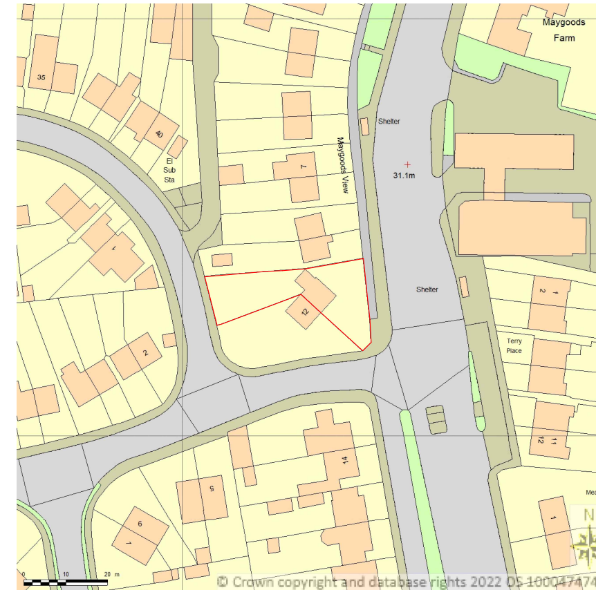
Location Plan @ 1:1250