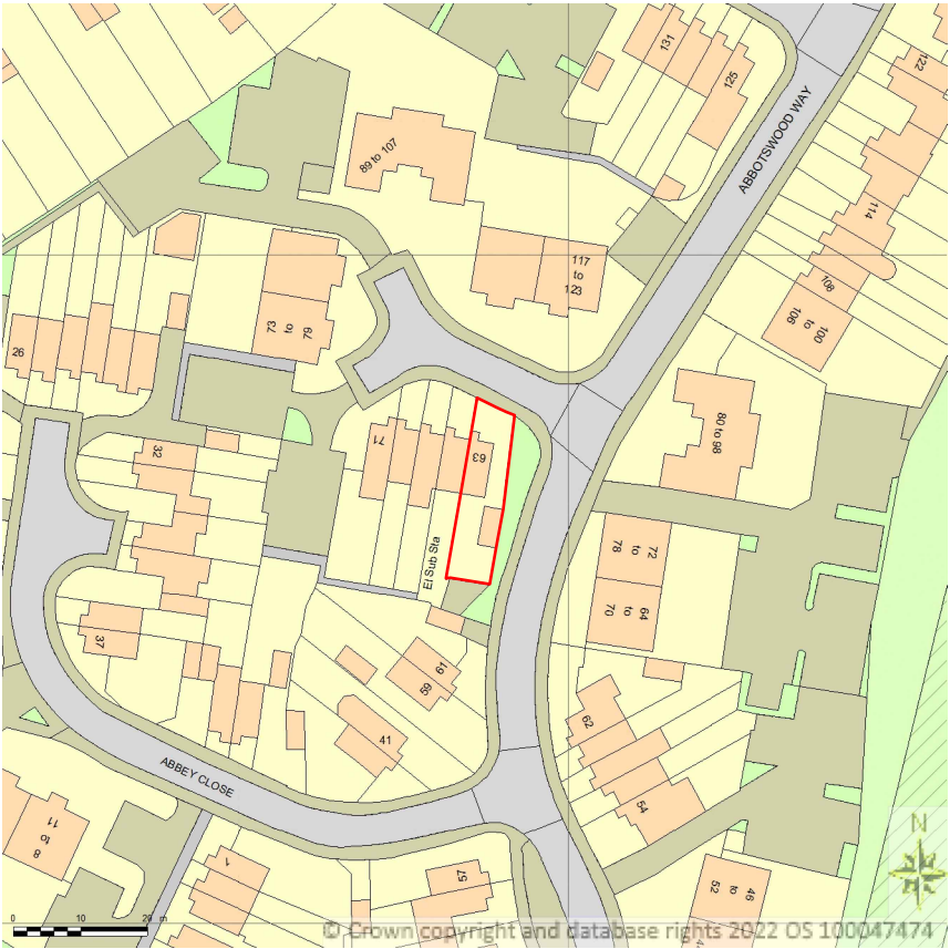
Location Plan@ 1:1250

Double Storey Side and Part Single Storey Part Double Storey Rear Extension