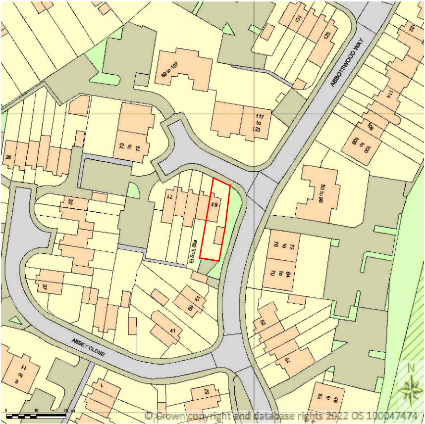
Location Plan@ 1:1250

Double Storey Side and Single Storey Rear Extension