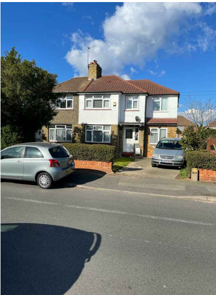
02- FRONT IMAGE