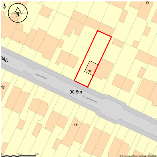
04 - OS MAP SCALE 1:1250