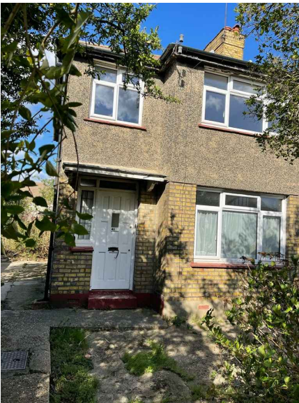
03- FRONT IMAGE