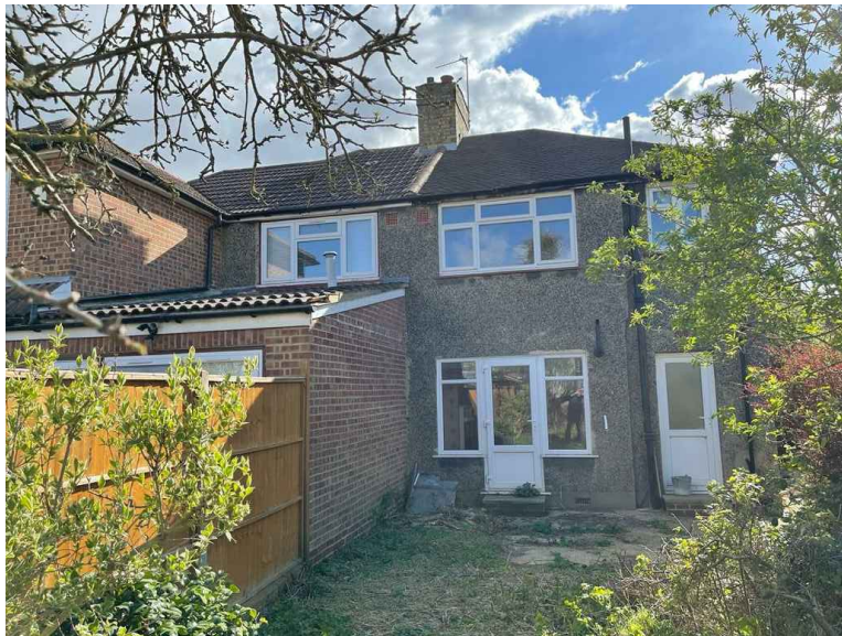
01- REAR IMAGE