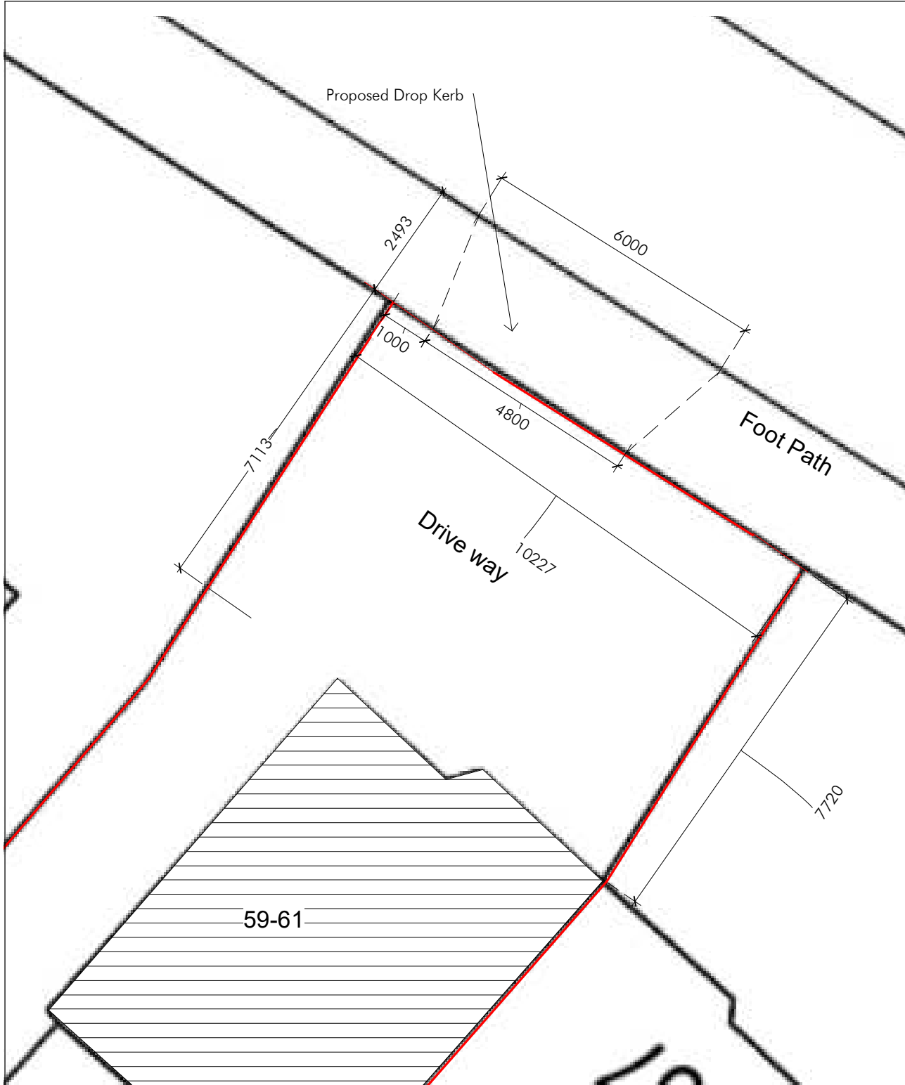
Plan - Proposed 1 : 100