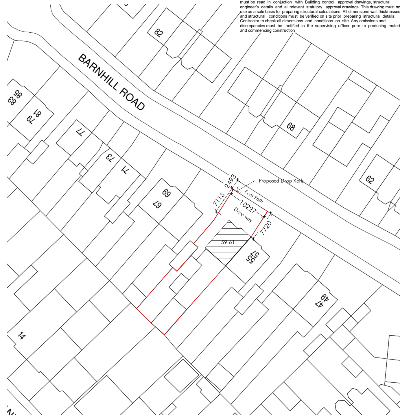
Site Plan - Proposed