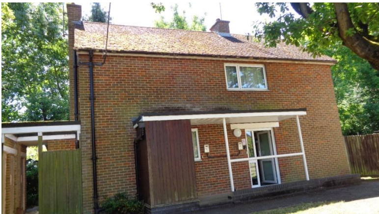
Front elevation of police station with ground floor front entrance door.