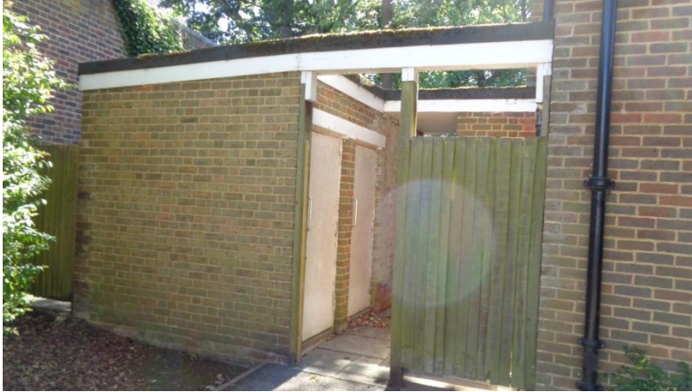
Front elevation external plant room. Heating unit to be located to rear behind Close boarded fence.

Ruislip Police Station, 5 The Oaks, Manor Road, Ruislip. HA4 7LE