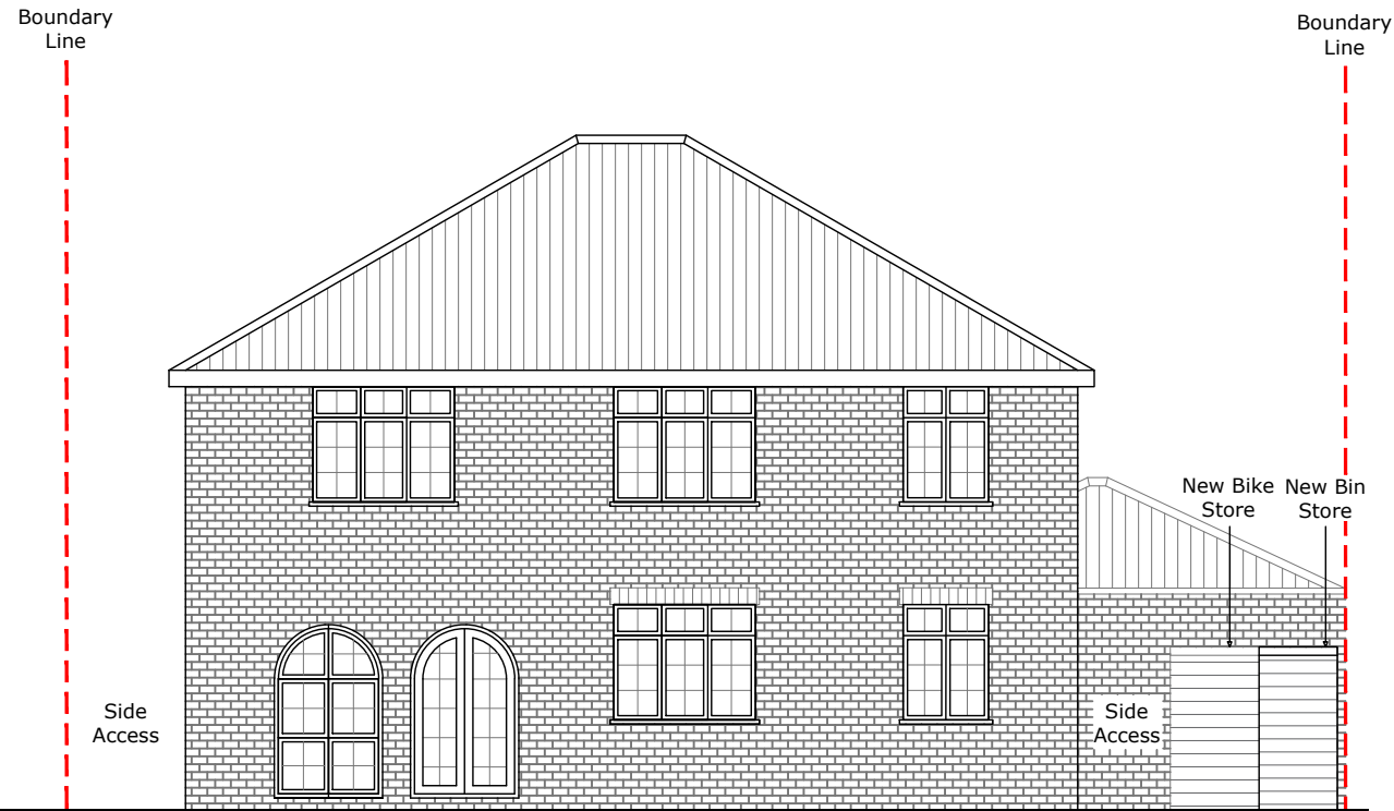
3 Proposed North Elevation 1:100 - Rear Elevation (No Changes to Existing Structure)