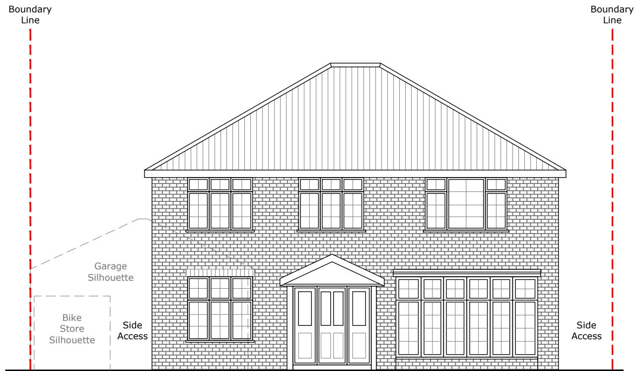
1 Proposed South Elevation 1:100 - Front Elevation (No Changes to Existing Structure)