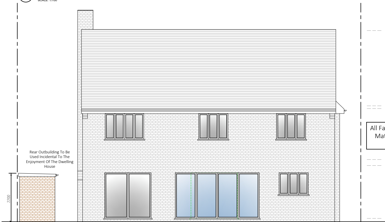
7 Proposed Side Elevation