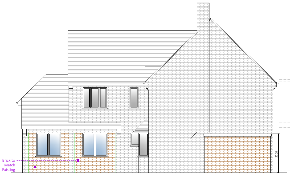
8 Proposed Side Elevation