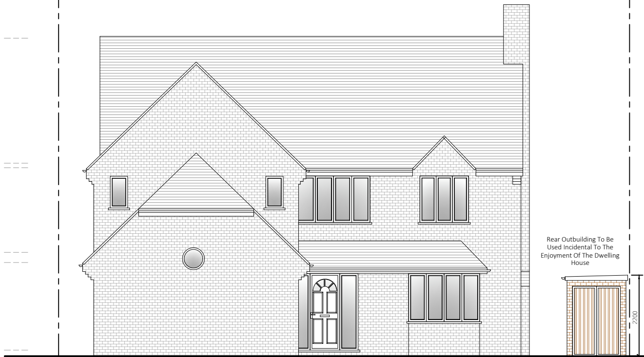
5 Proposed Front Elevation