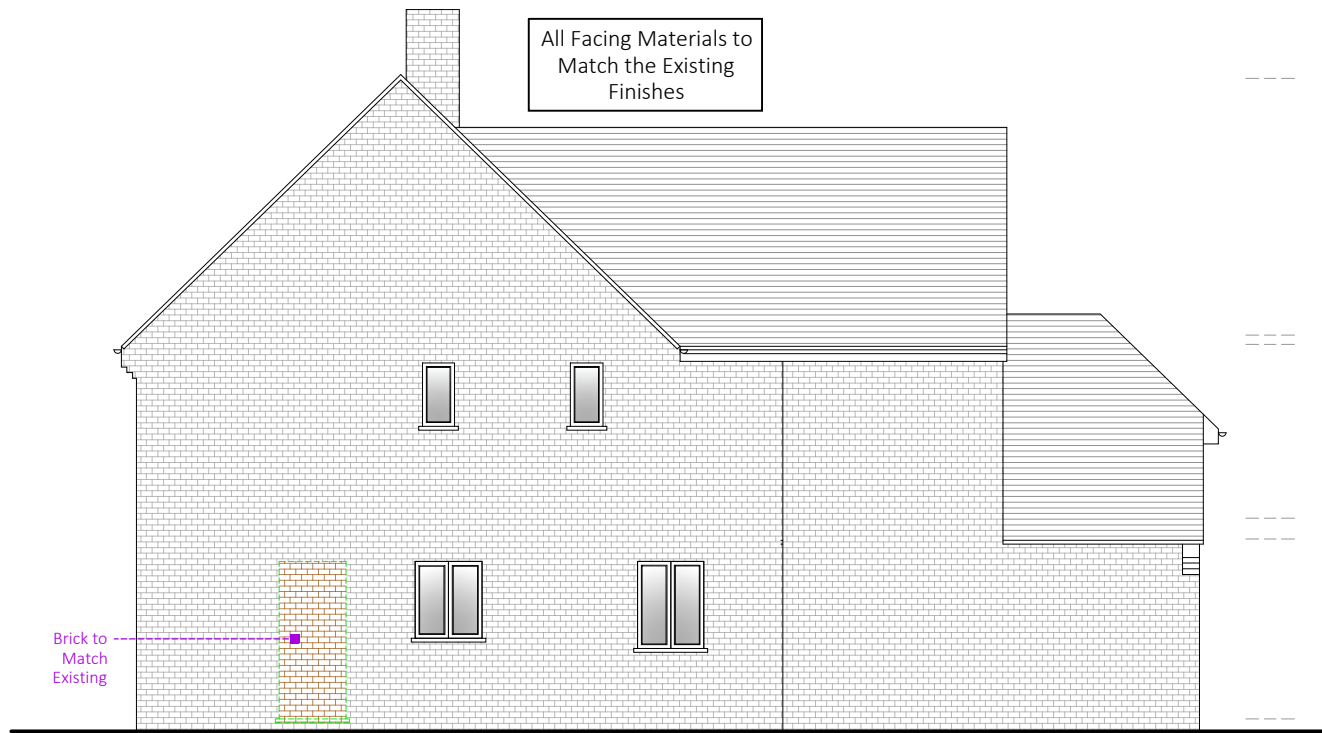
6 Proposed Side Elevation