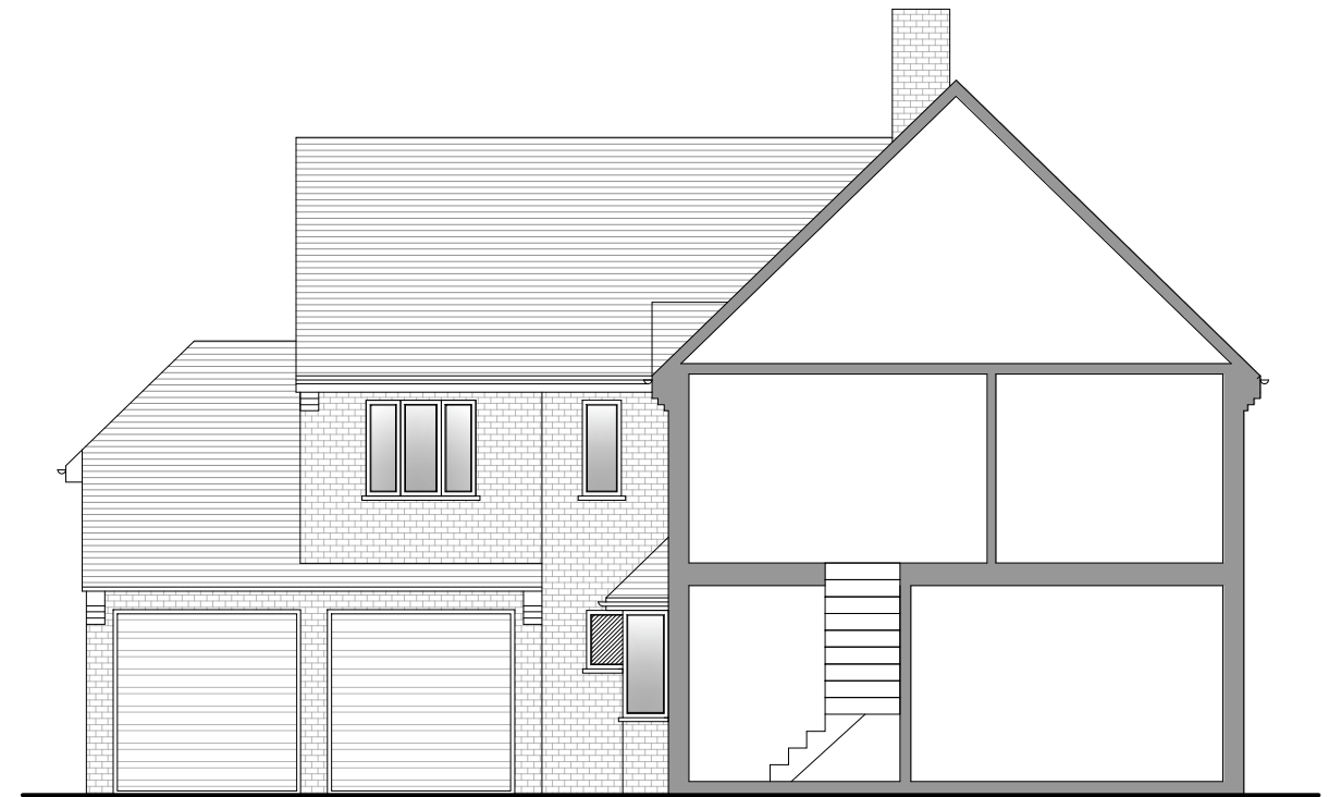
8 Existing Side Section SCALE: 1/100