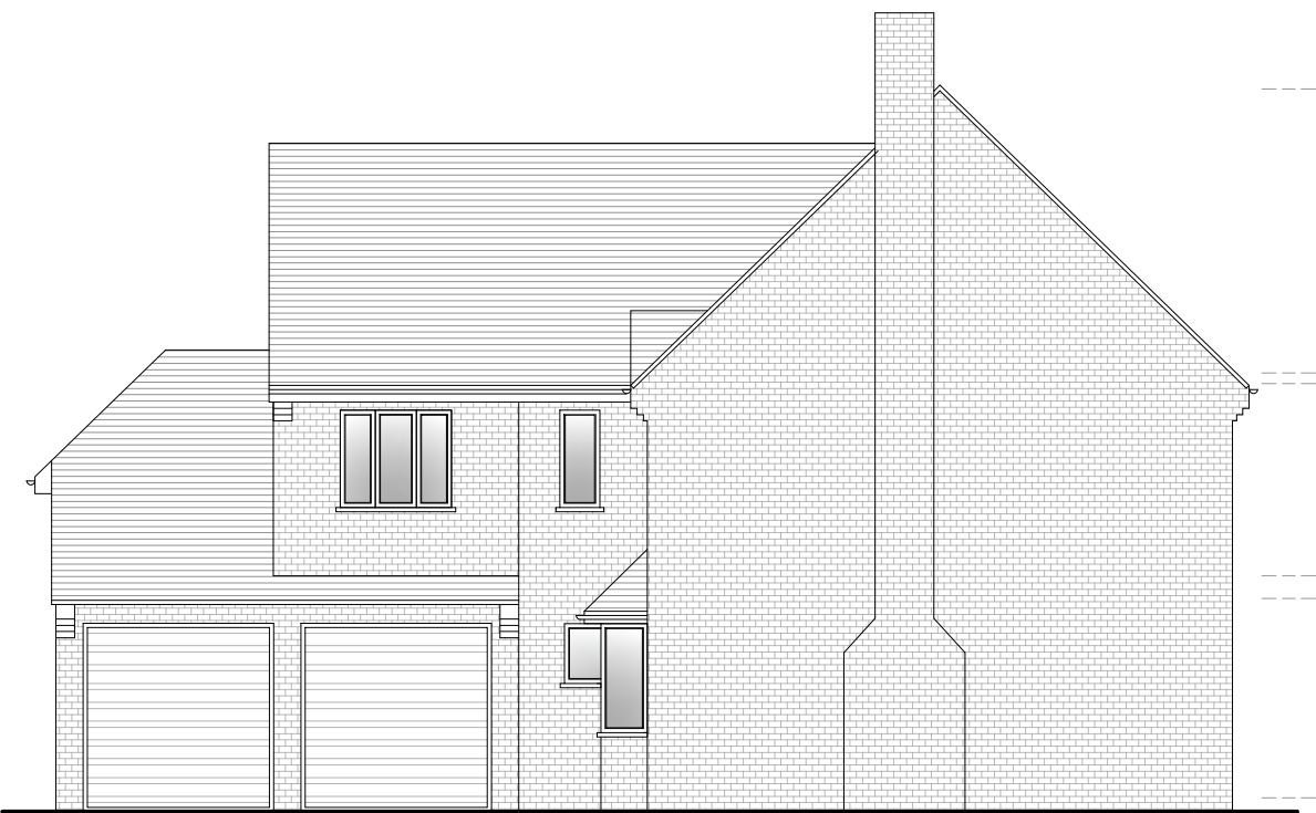
7 Existing Side Elevation