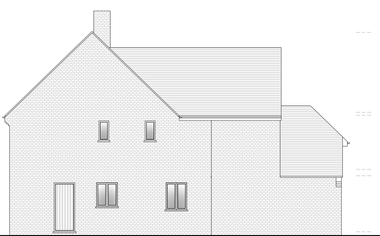
5 Existing Side Elevation