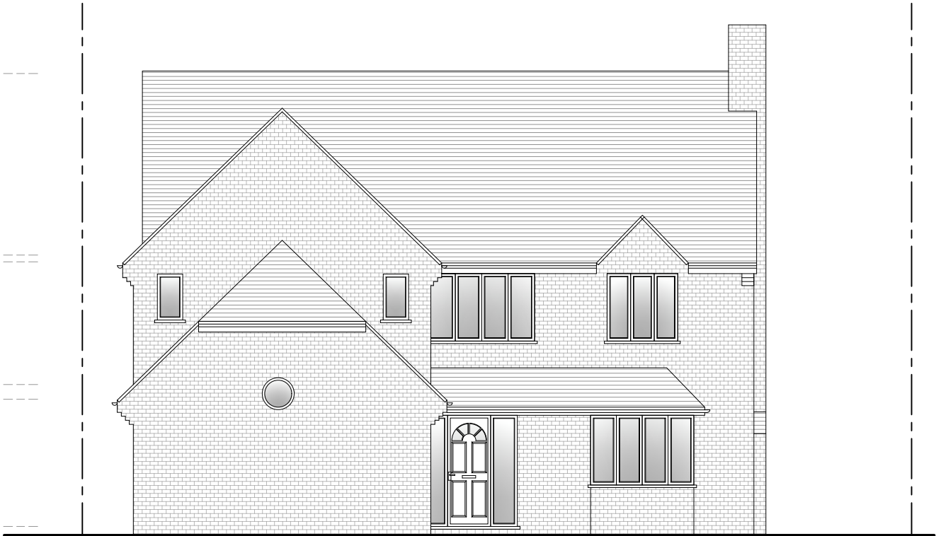
4 Existing Front Elevation