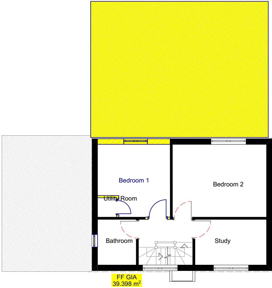
3 01-First Floor 1:100