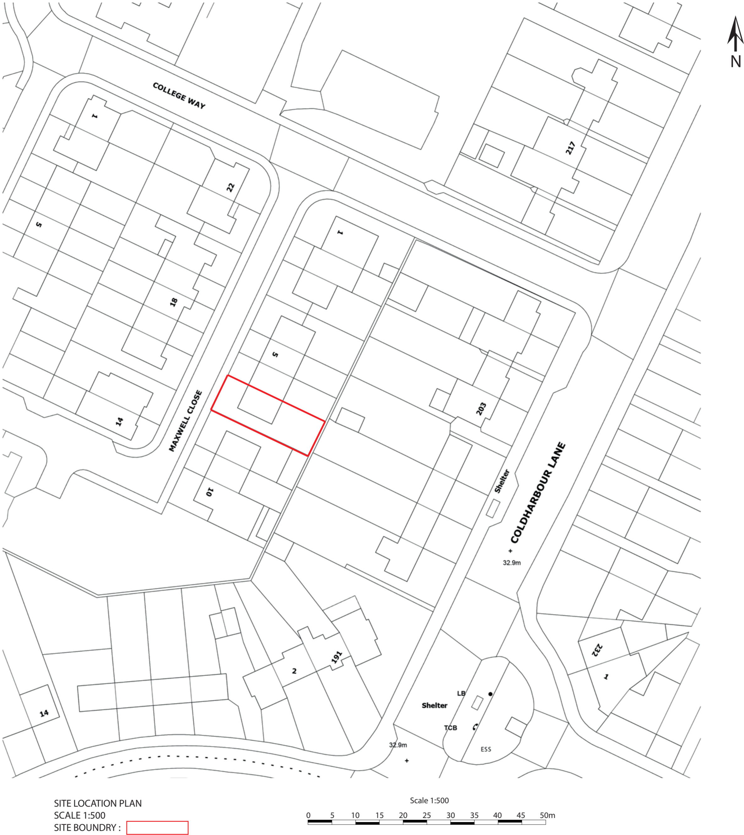
SITE LOCATION PLAN SCALE 1:500 SITE BOUNDRY :