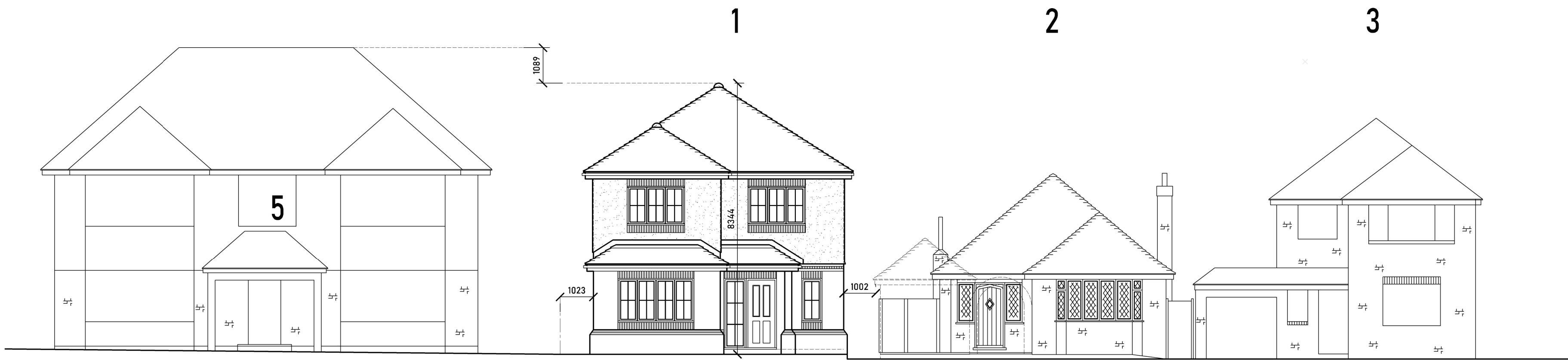
PROPOSED DWELLING STREET SCENE