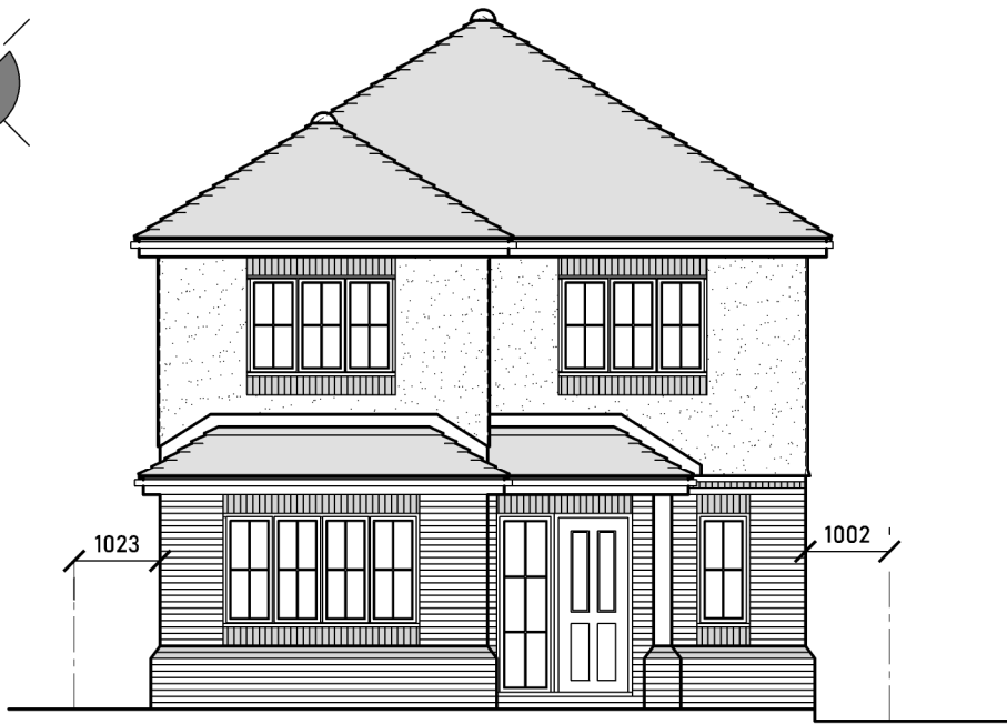
PROPOSED DWELLING FRONT ELEVATION