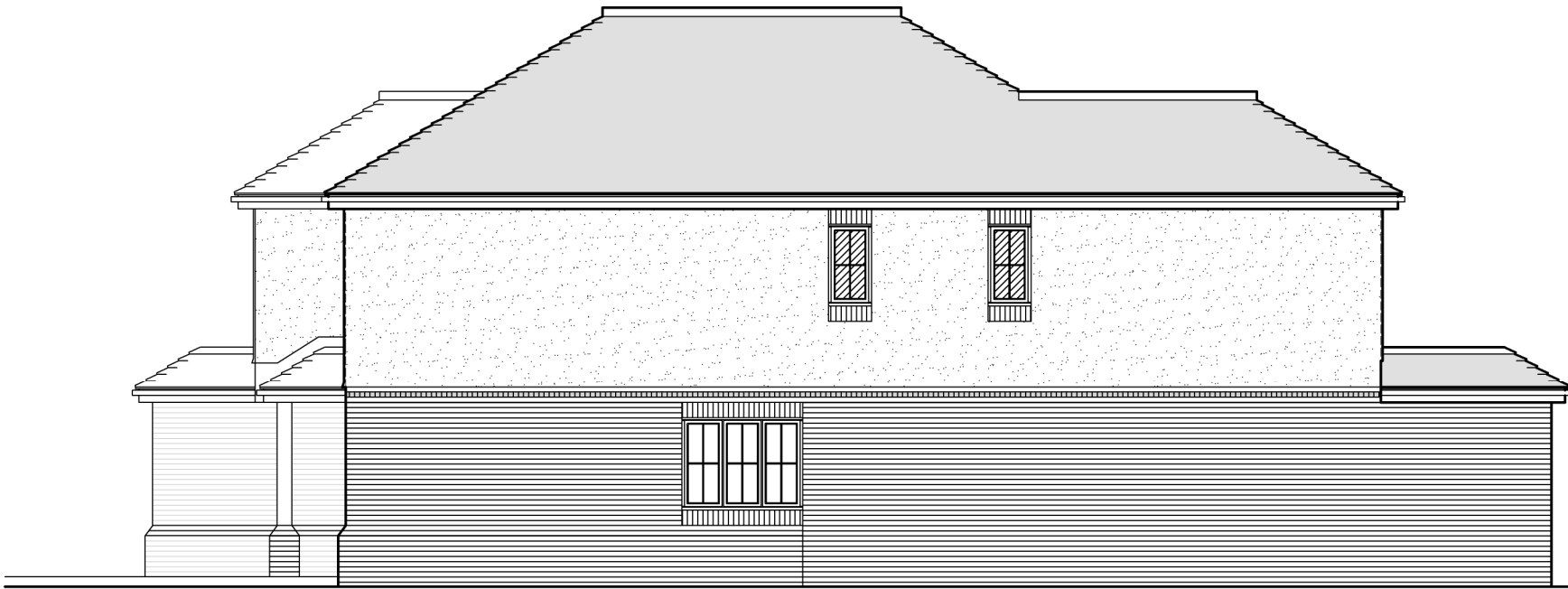
PROPOSED DWELLING SIDE (SOUTH - WEST) ELEVATION

NOTE: All first floor side facing windows to be obscure glazed and non-opening below 1.7m