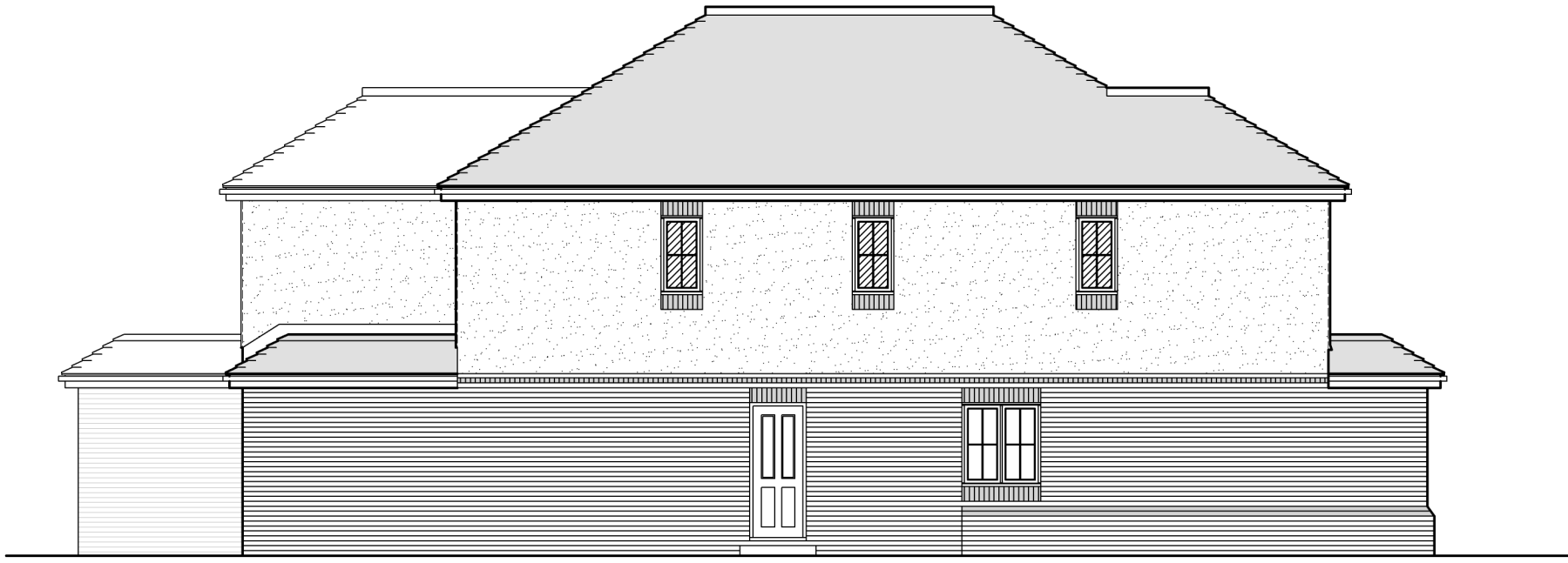
PROPOSED DWELLING SIDE (NORTH - EAST) ELEVATION

NOTE: All first floor side facing windows to be obscure glazed and non-opening below 1.7m