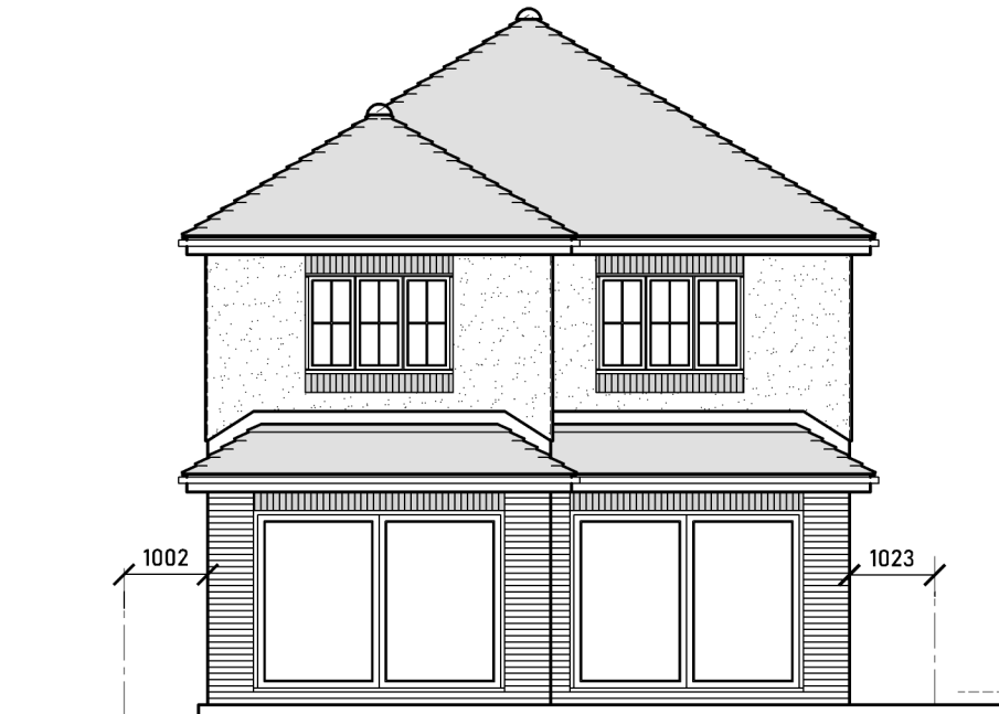
PROPOSED DWELLING REAR ELEVATION

NOTE: All first floor side facing windows to be obscure glazed and non-opening below 1.7m