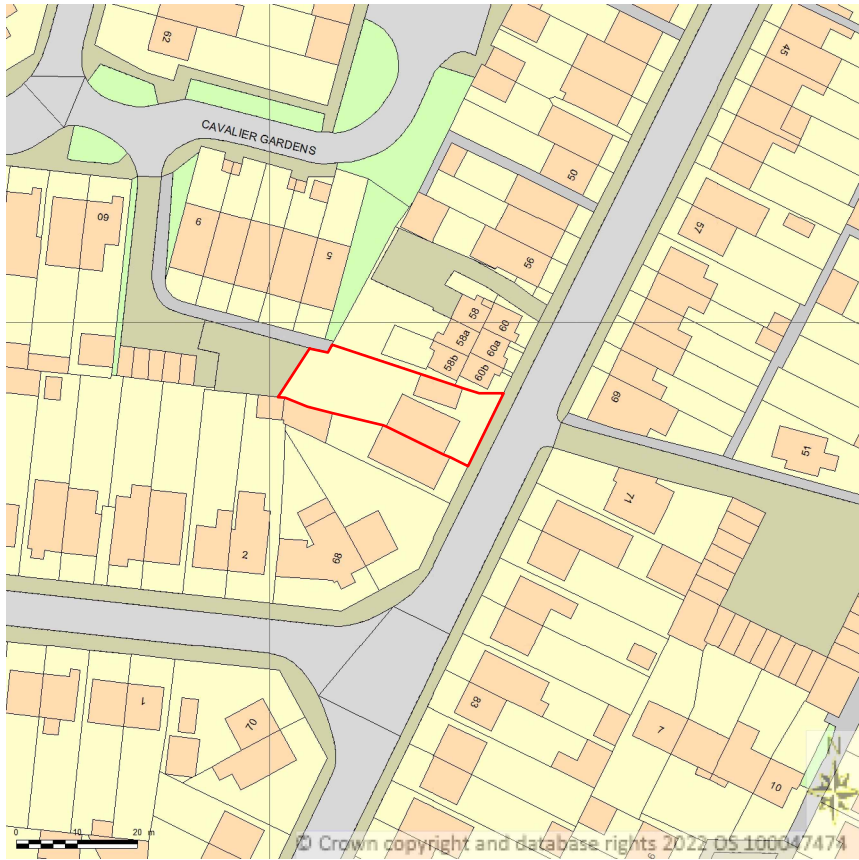
Location Plan @ 1:1250