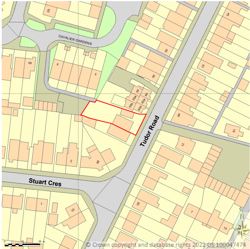
Location Plan@ 1:1250

Double storey side extension and Single storey rear extension