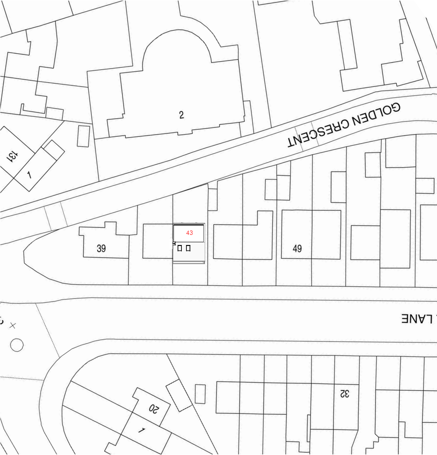
Site Plan 1 : 500

This is not a construction drawing and must used for planning approval only, this drawings must be read in conjunction with Building control approval drawings, structural engineer's details and all relevant statutory approval drawings. This drawing must not use as a sole basis for preparing structural calculations. All dimensions wall thicknesses and structural conditions must be verified on site prior preparing structural details. Contractor to check all dimensions and conditions on site. Any omissions and discrepancies must be notified to the supervising officer prior to producing material and commencing construction