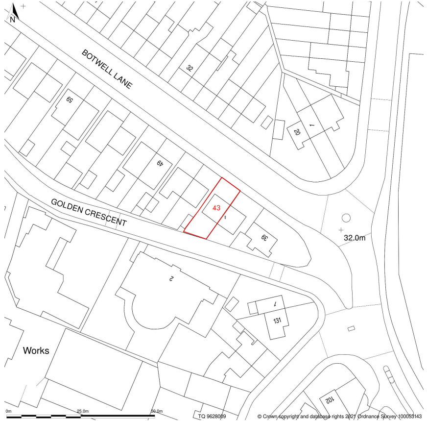
Location Plan 1 : 1250