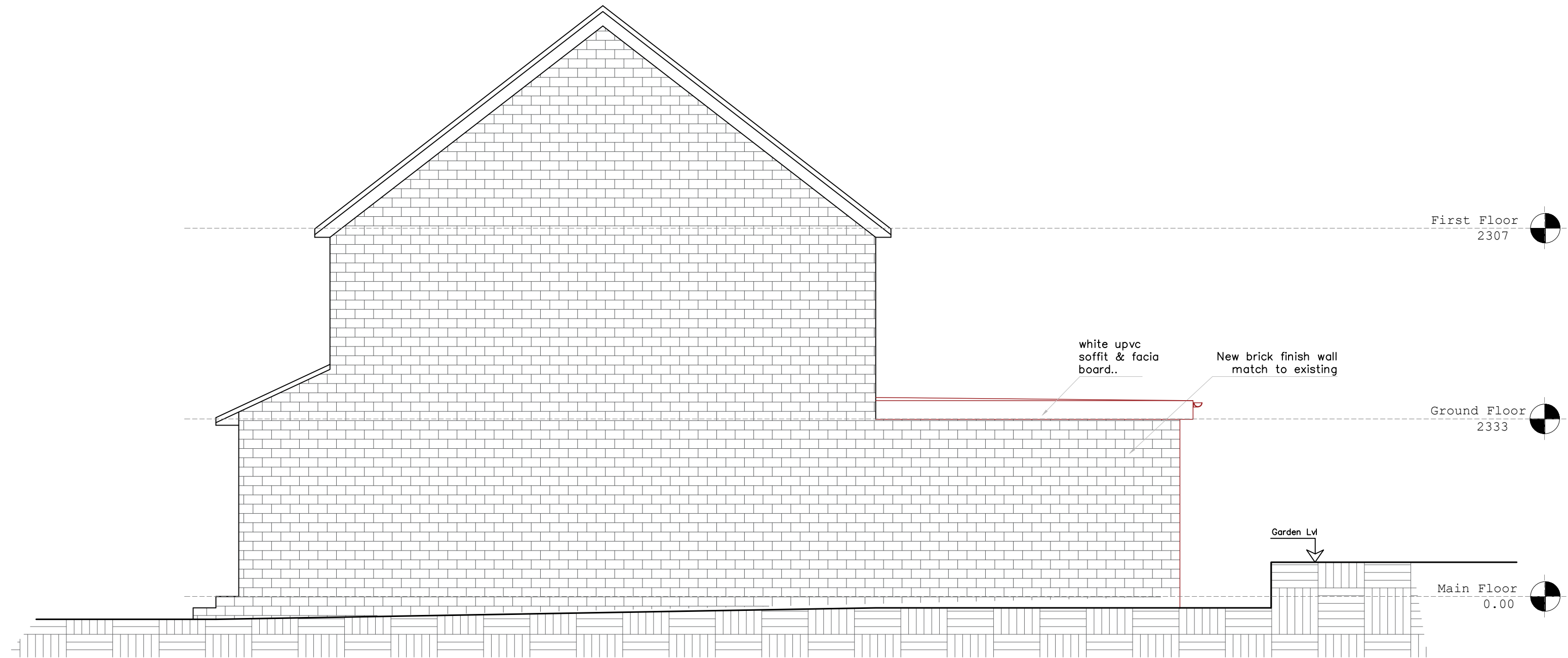
PROPOSED ELEVATION/VIEW B SCALE 1:50