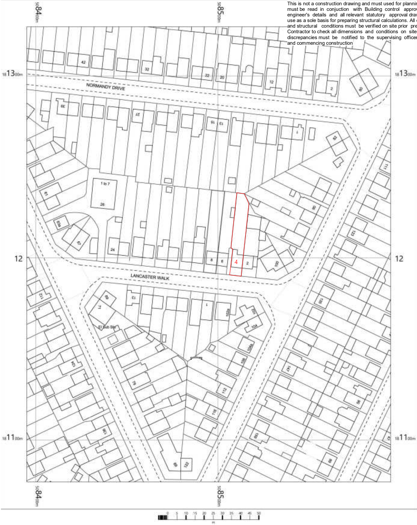
Location Plan 1 : 1250

This is not a construction drawing and must be used for planning approval only, this drawings must be read in conjunction with Building control approval drawings, structural engineer's details and all relevant statutory approval drawings. This drawing must not be used as a sole basis for preparing structural calculations. All dimensions wall thicknesses and structural conditions must be verified on site prior preparing structural details. Contractor to check all dimensions and conditions on site. Any omissions and discrepancies must be notified to the supervising officer prior to producing material and commencing construction