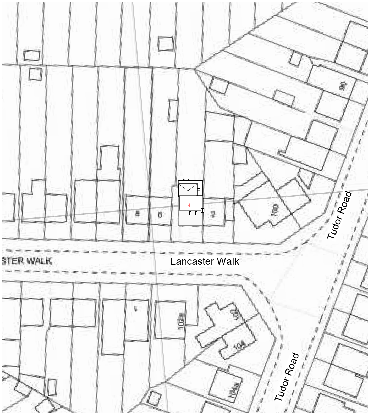
Site Plan 1 : 500