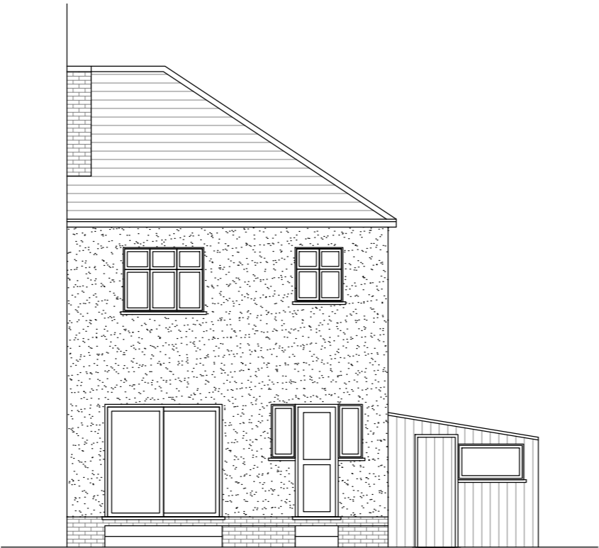
Existing Rear Elevation Scale 1:100