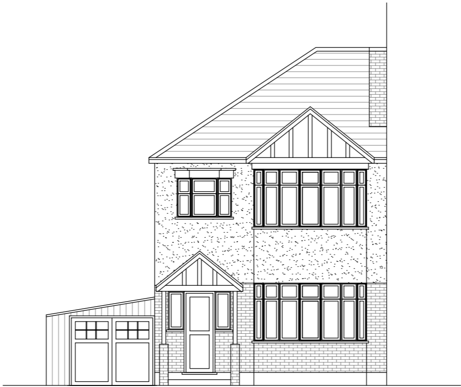
Existing Front Elevation Scale 1:100