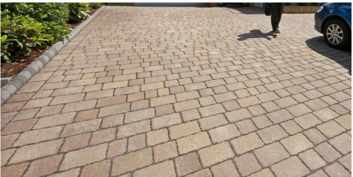
Tegula priora harvest