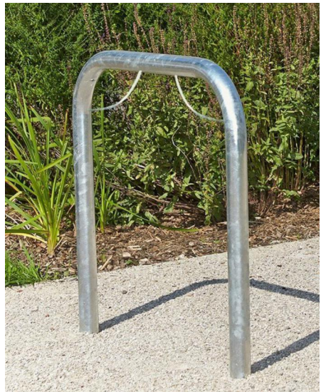
Sheffield bike stand

Existing conifer tree removed. Deciduous tree retained, Ivy removed.