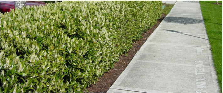
Prunus laurocerasus "Otto Luykens"