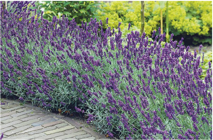
Lavandula augustifolia "HidCote"