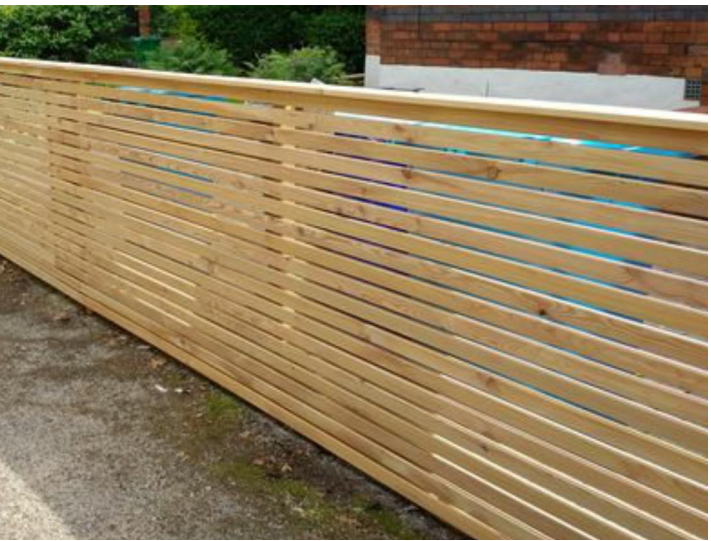
Typical slatted screen for bins