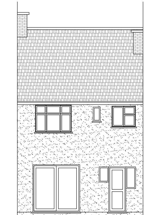
Existing Rear Elevation Scale 1:100