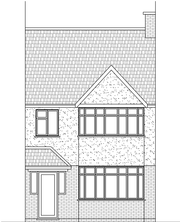
Existing Front Elevation Scale 1:100