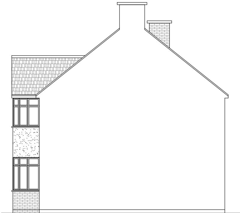
Existing Side Elevation Scale 1:100