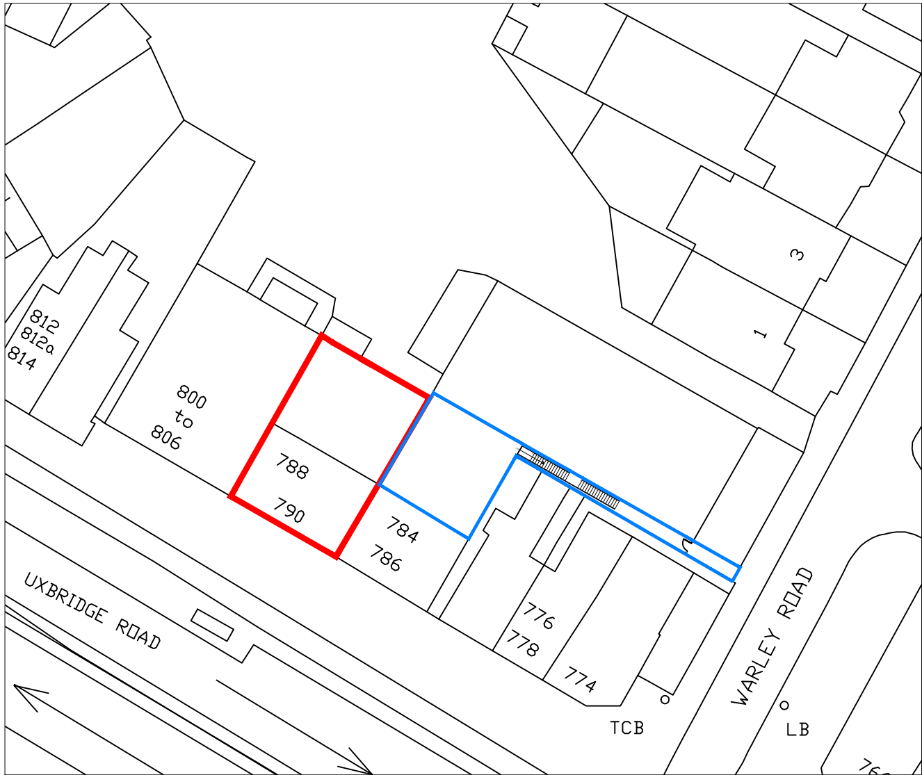
BLOCK PLAN (SCALE 1:500)