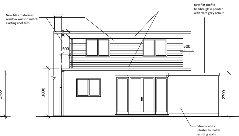
Proposed Exterior Rear Elevation H Scale 1:100