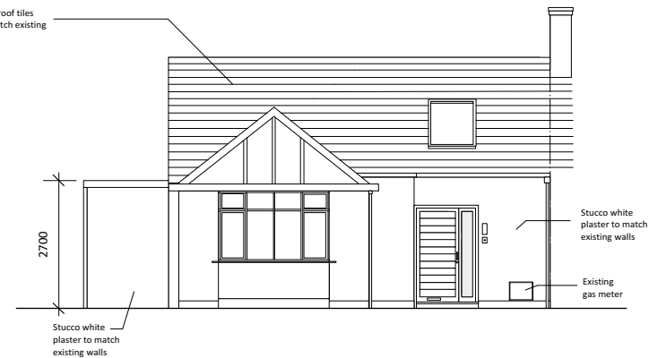
Proposed Exterior Front Elevation F Scale 1:100