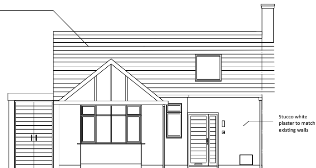
Proposed Exterior Front Elevation F Scale 1:100