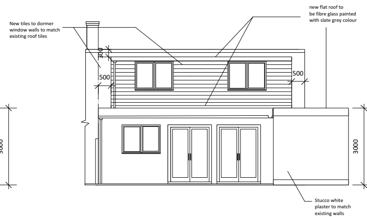
Proposed Exterior Rear Elevation H Scale 1:100