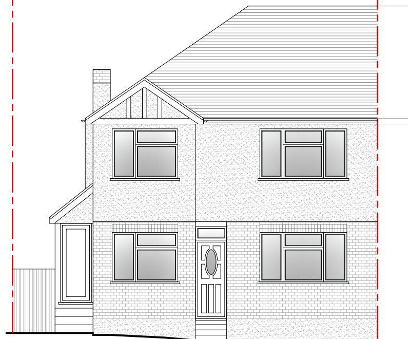
3 Proposed Front Elevation