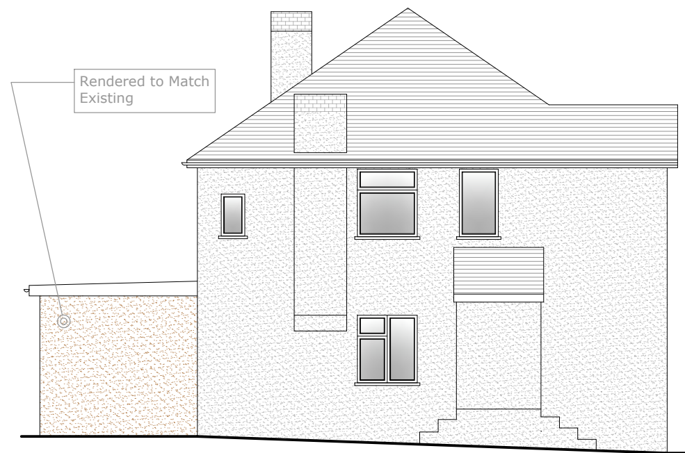
4 Proposed Side Elevation