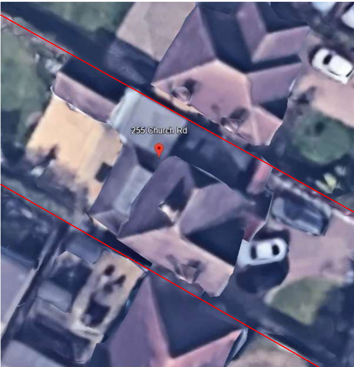
AERIAL VIEW Site shown in red

Description of proposed works Outbuilding single storey, flat roof to be used as an Gym/Store