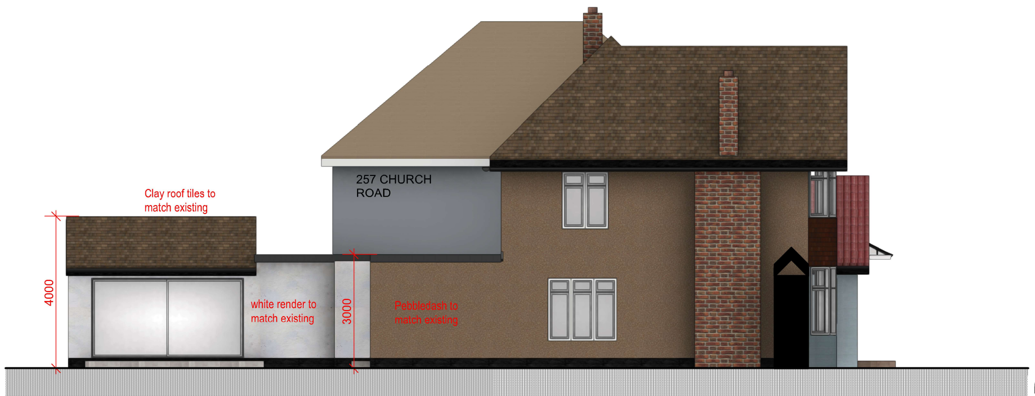
02 02 PROP ELEV SIDE Scale: 1:100

- Pitch roof - Plain roof tiles. Tile type, size & colour to match existing. Flat roof - to be GRP grey/green colour