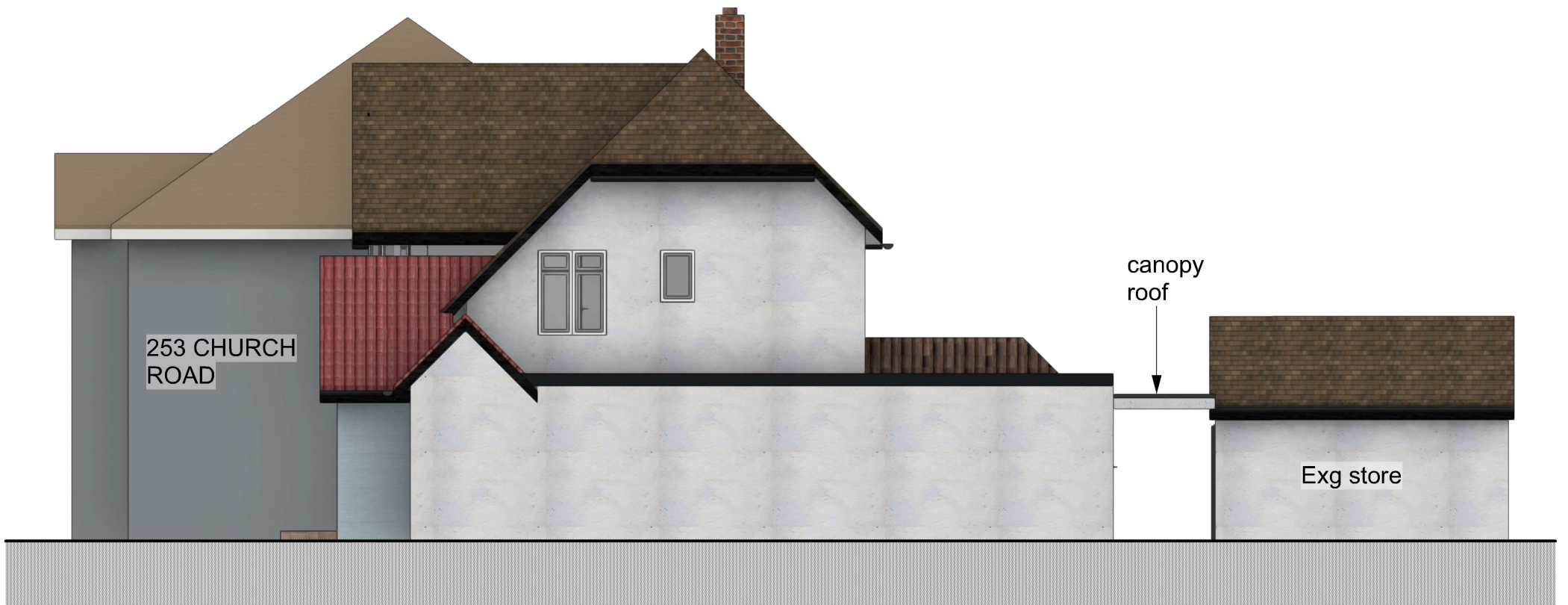
01 01 EXG ELEV SIDE Scale: 1:100