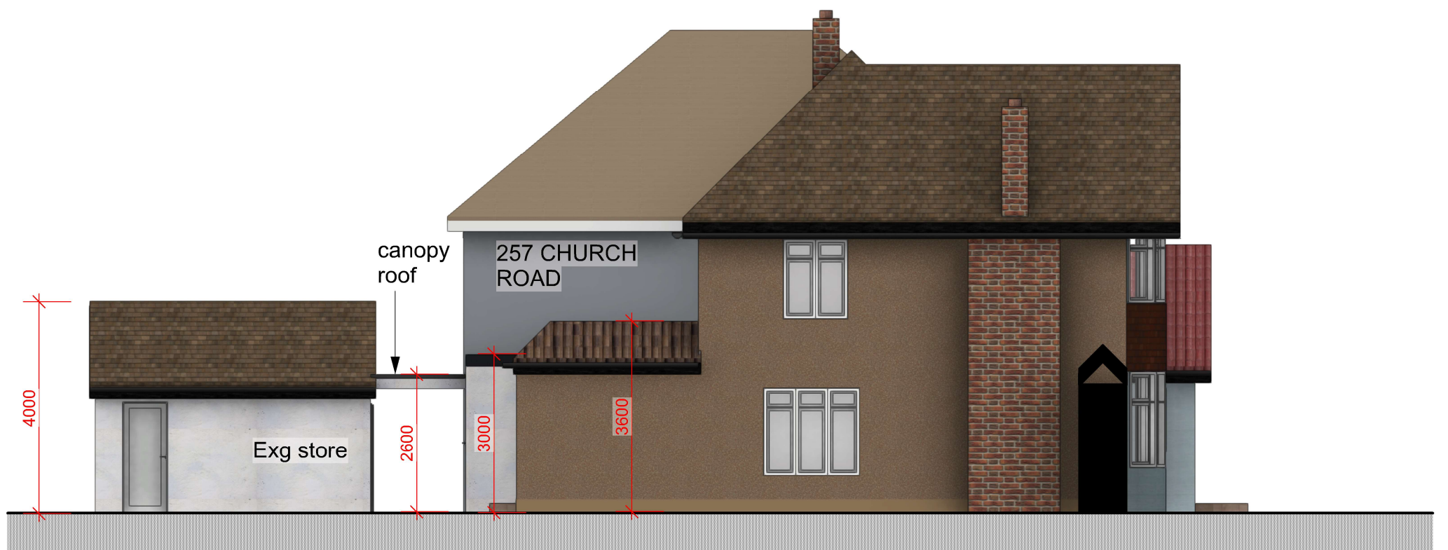
02 02 EXG ELEV SIDE Scale: 1:100

REV A - 20/03/2024 Roof heighth dims added in red