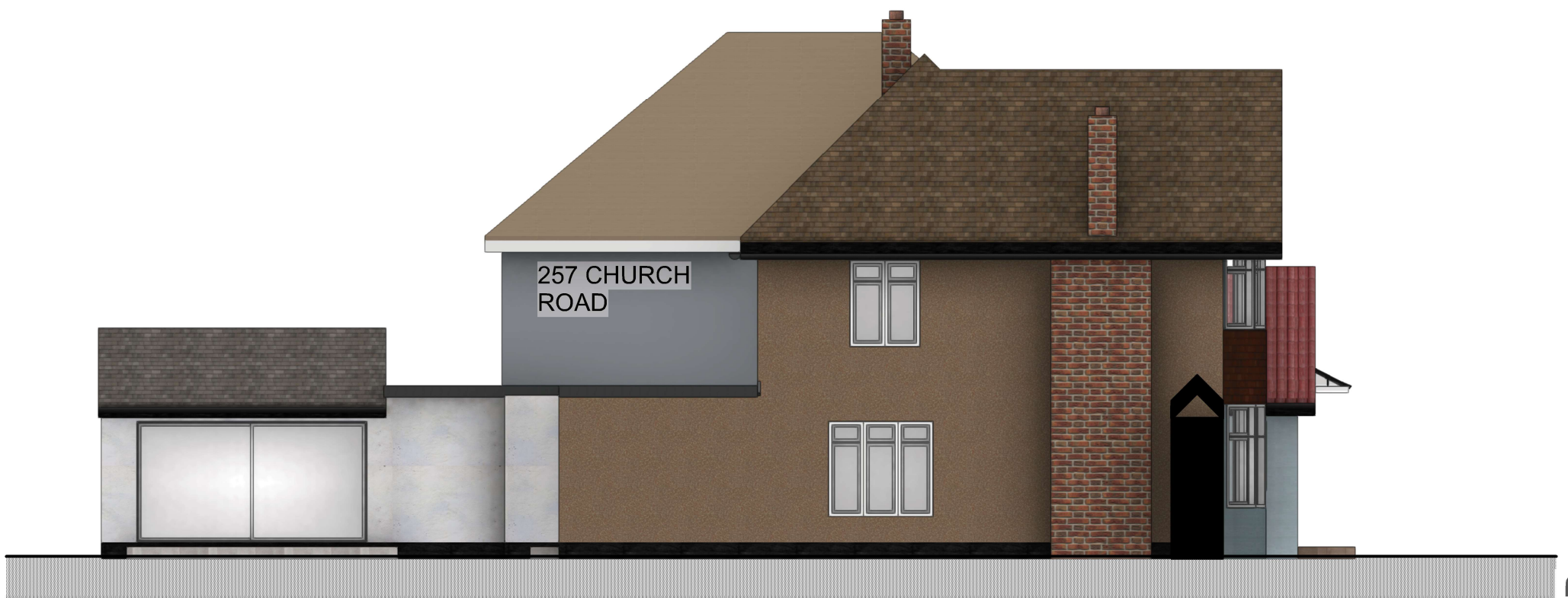
02 02 PROP ELEV SIDE Scale: 1:100