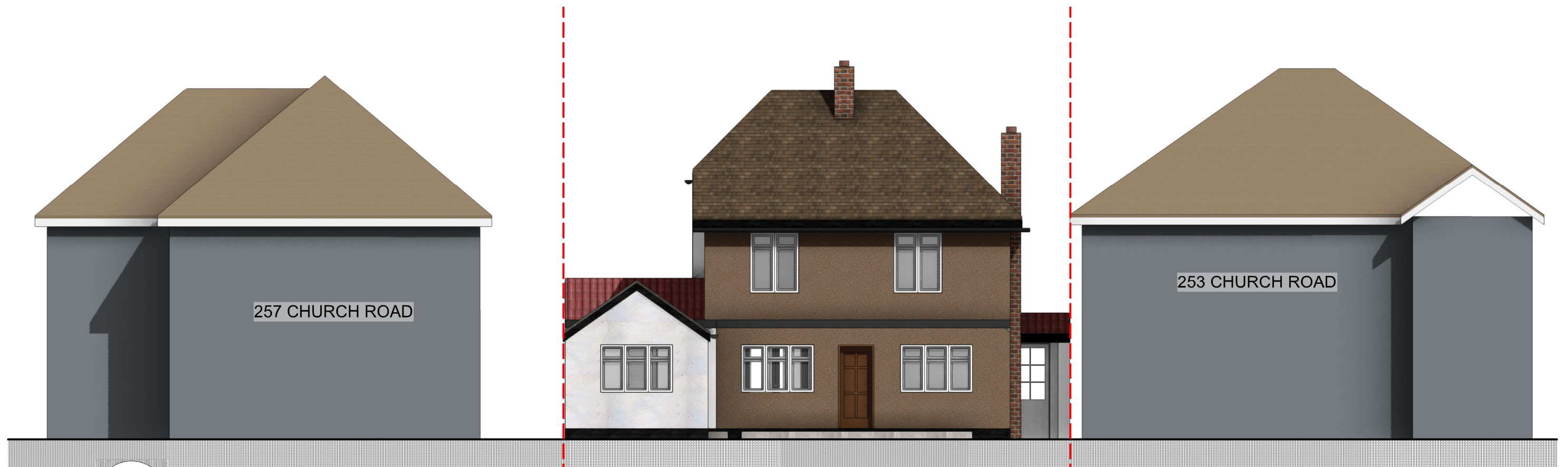
02 02 PROP ELEV REAR Scale: 1:100