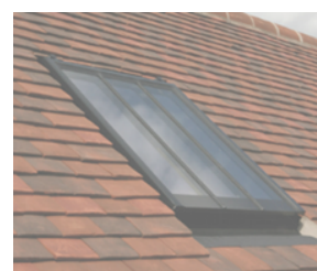
CONSERVATION ROOFLIGHT Suitable for plain roof tiles & to give a seamless flush finish.

- Pitch roof - Plain roof tiles. Tile type, size & colour to match existing. Flat roof and dormer flat roof - to be GRP grey/green colour