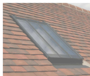
CONSERVATION ROOFLIGHT Suitable for plain roof tiles & to give a seamless flush finish.