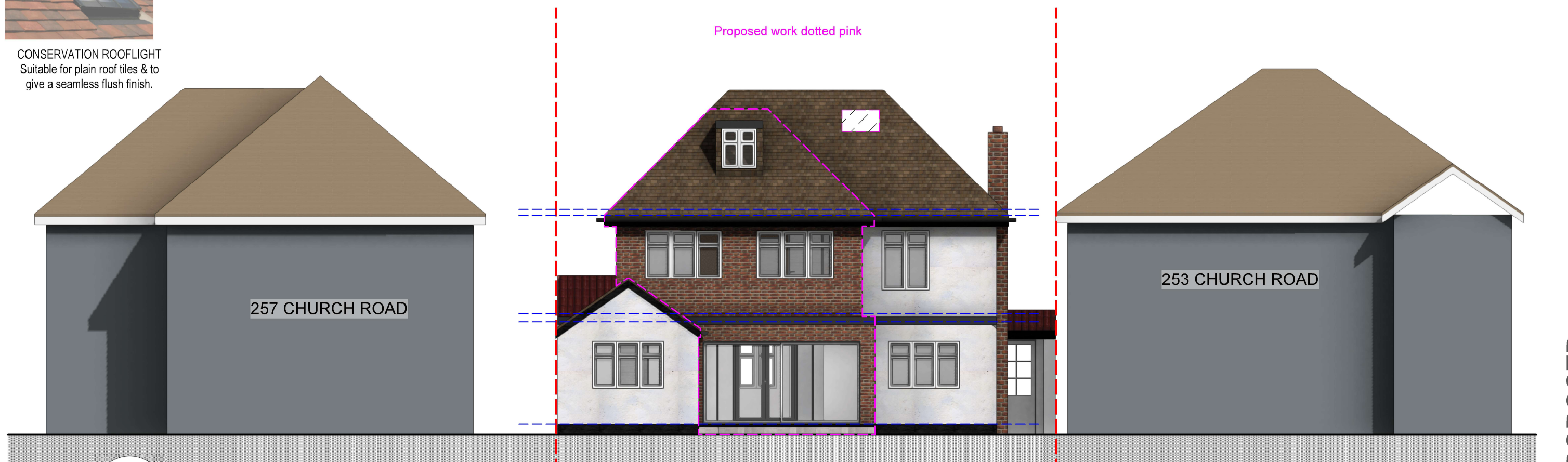
02 02 PROP ELEV REAR Scale: 1:100

Purpose - Householder planning application