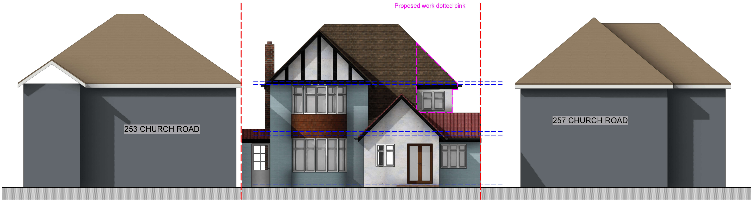
2 01 PROP ELEV FRONT Scale: 1:100