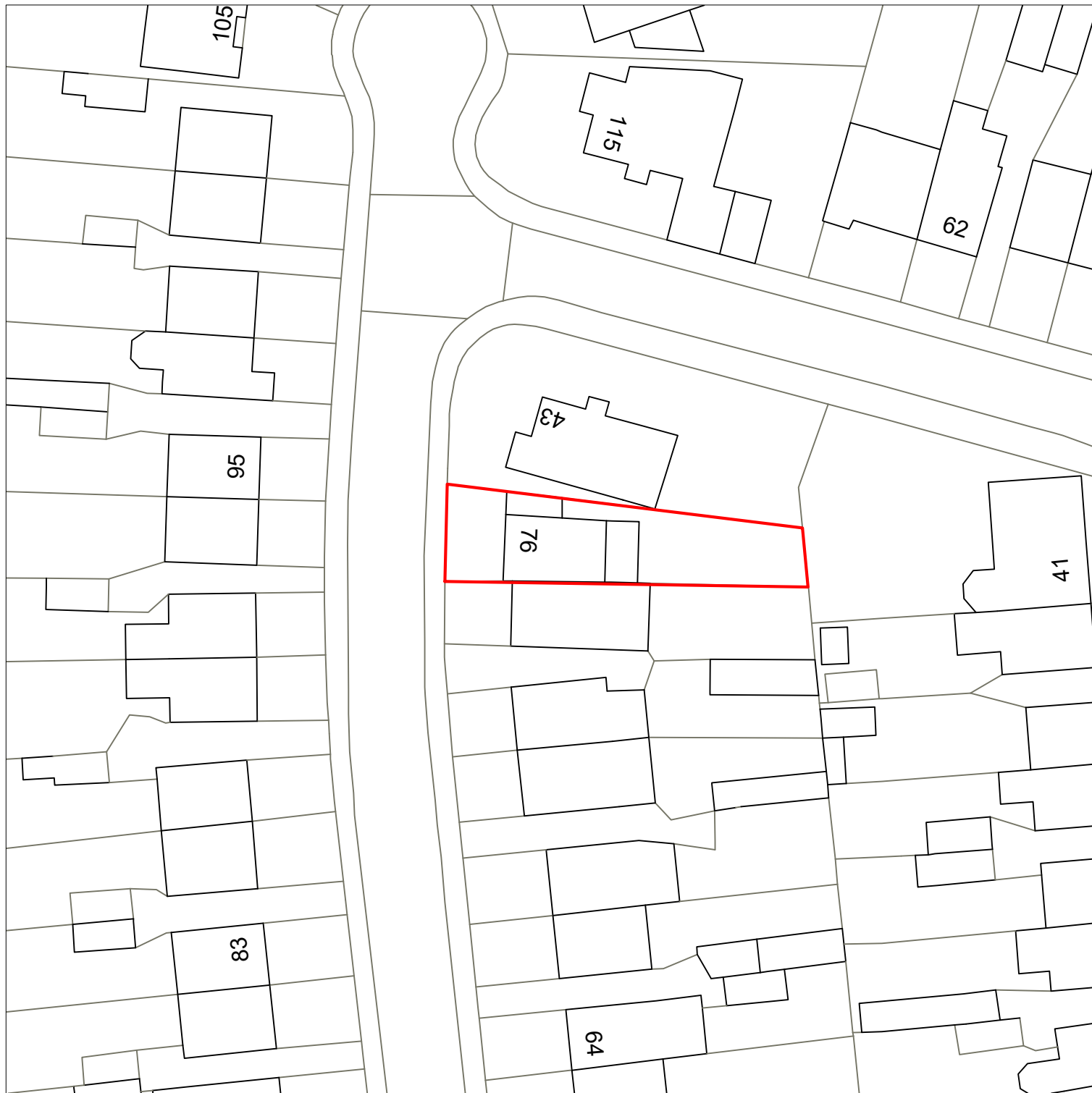
BLOCK PLANS 1:500