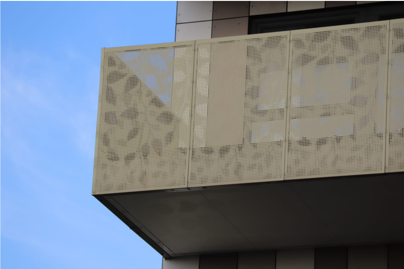
Examples of similar application

Imeges used to demonstrate application on completed examples, not to specify manufacturer.