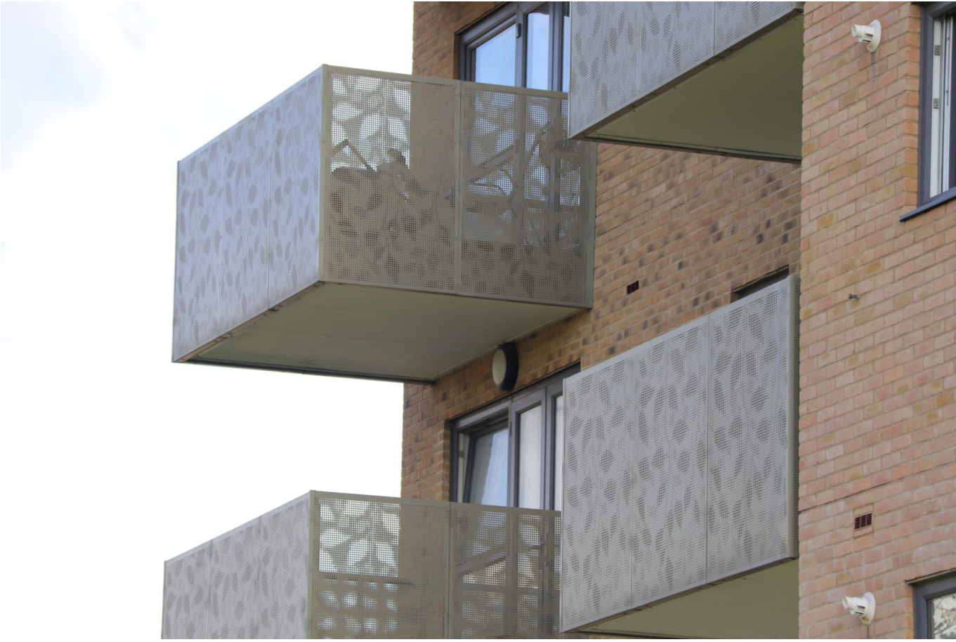
Examples of similar application

Pixeleted pattern used to produce planning drawings / CGI-s.