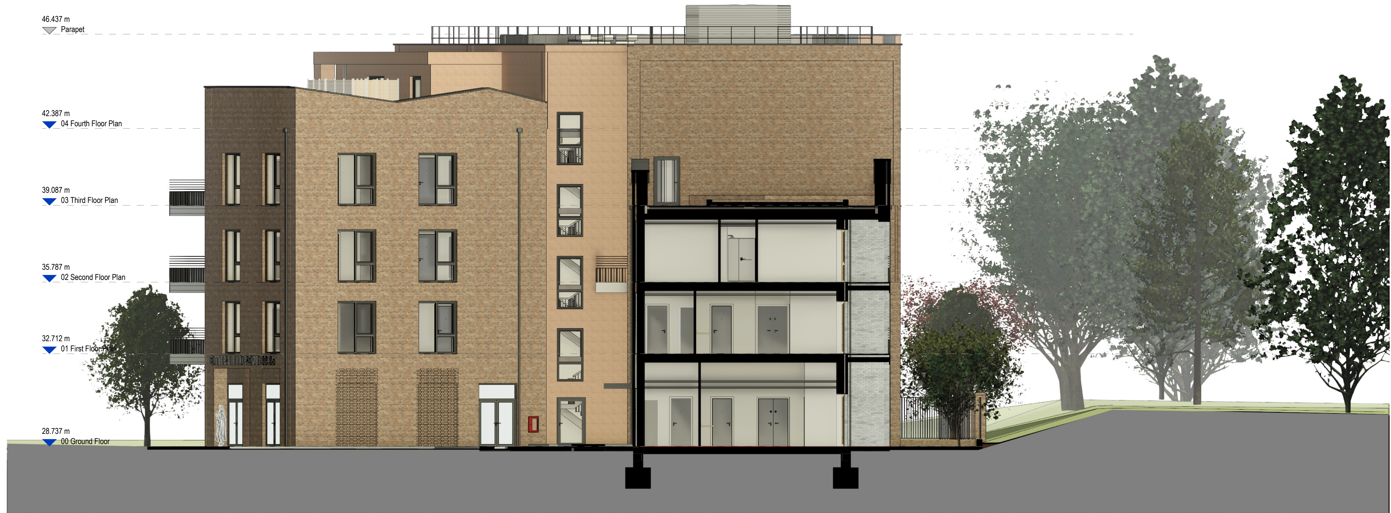
01 Section B-B 1 : 100