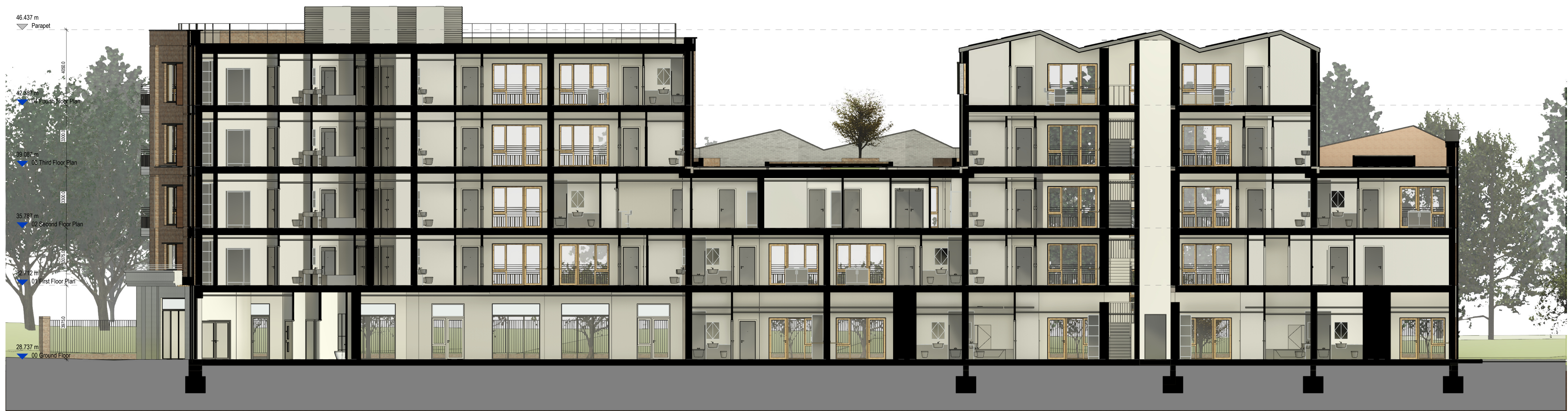
02 Section A-A 1 : 100