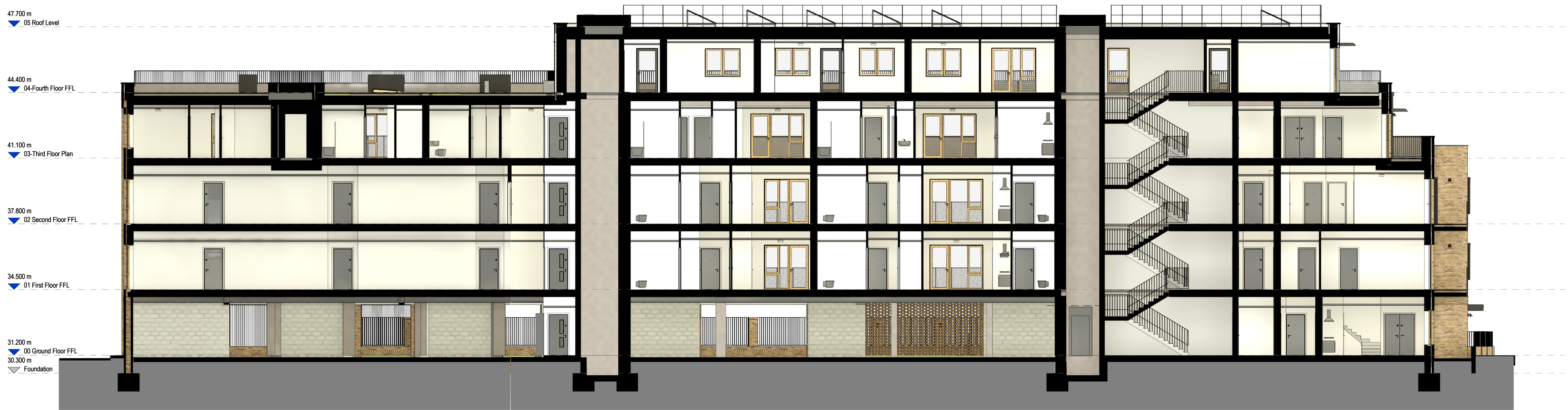
02 Longitudinal Section 2 1 : 100