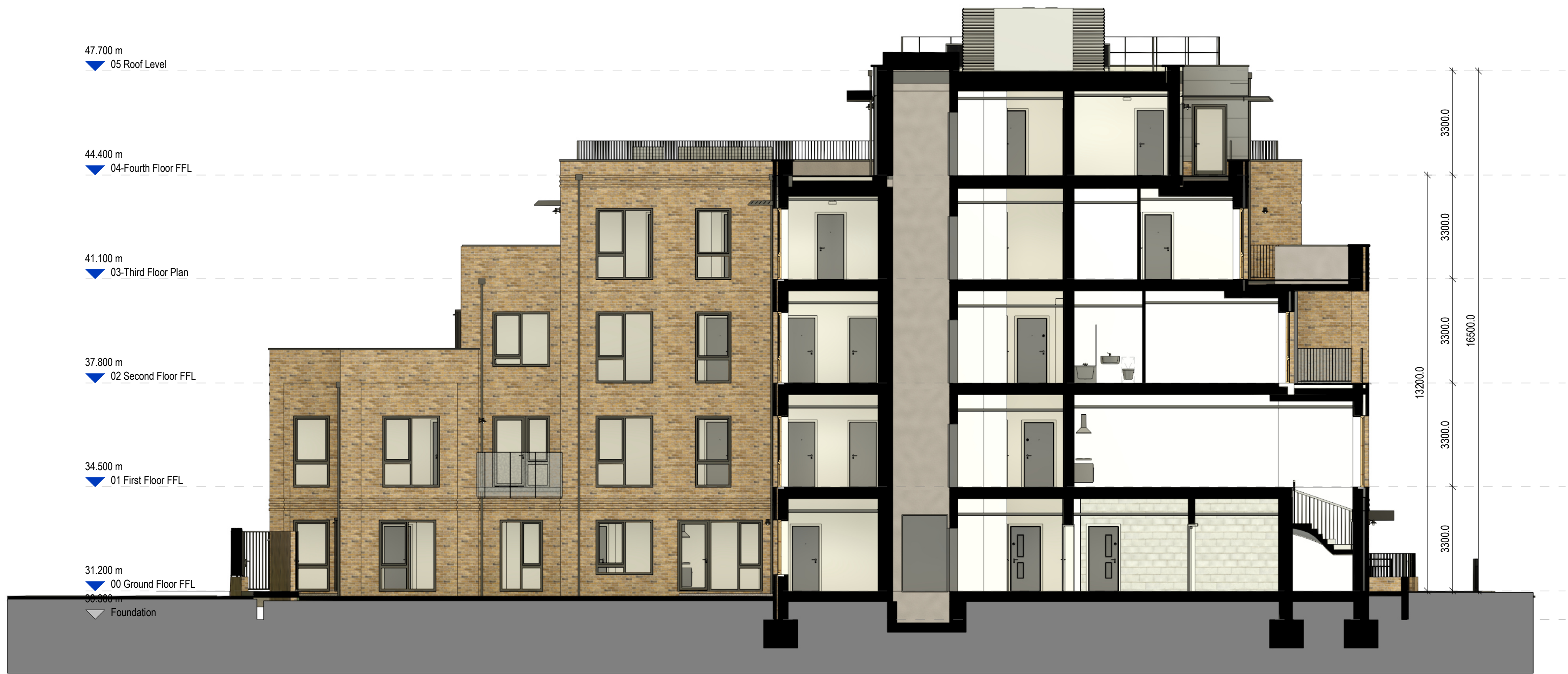
01 Cross Section 1 : 100