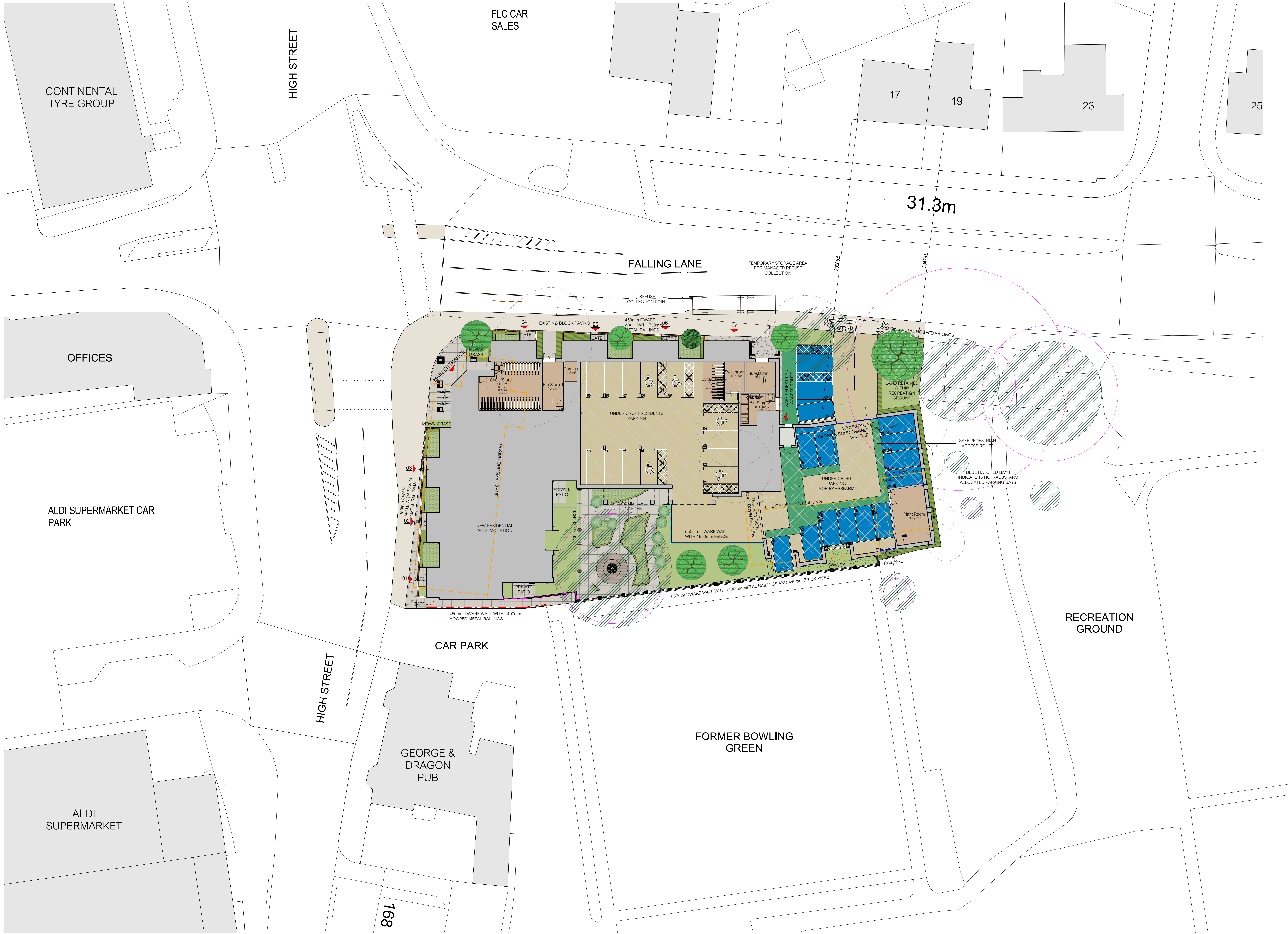
01 XX-Proposed Site Plan 1 : 200