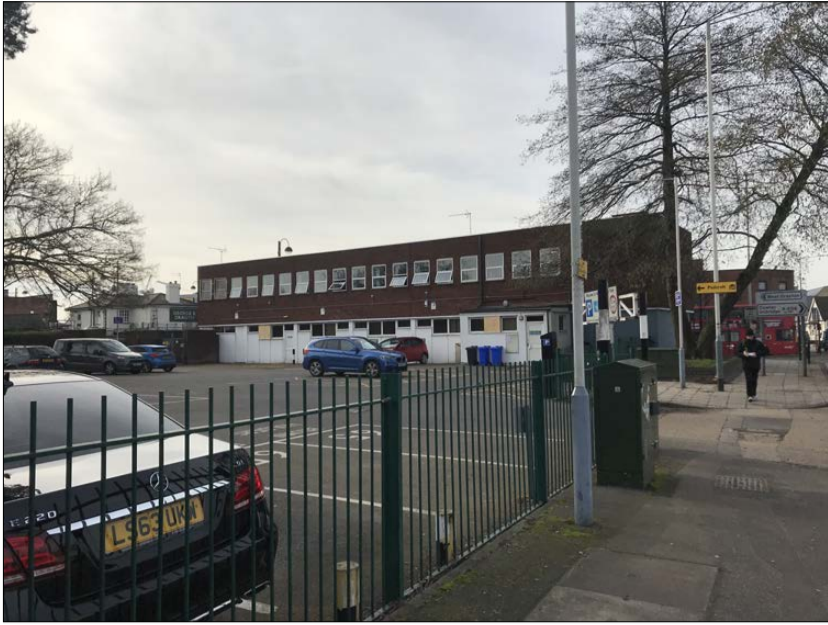
1.0 Yiewsley Library Site - View South across Existing Car Park