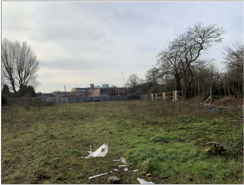
2.0 Yiewsley Former Pool Site - View South over the site