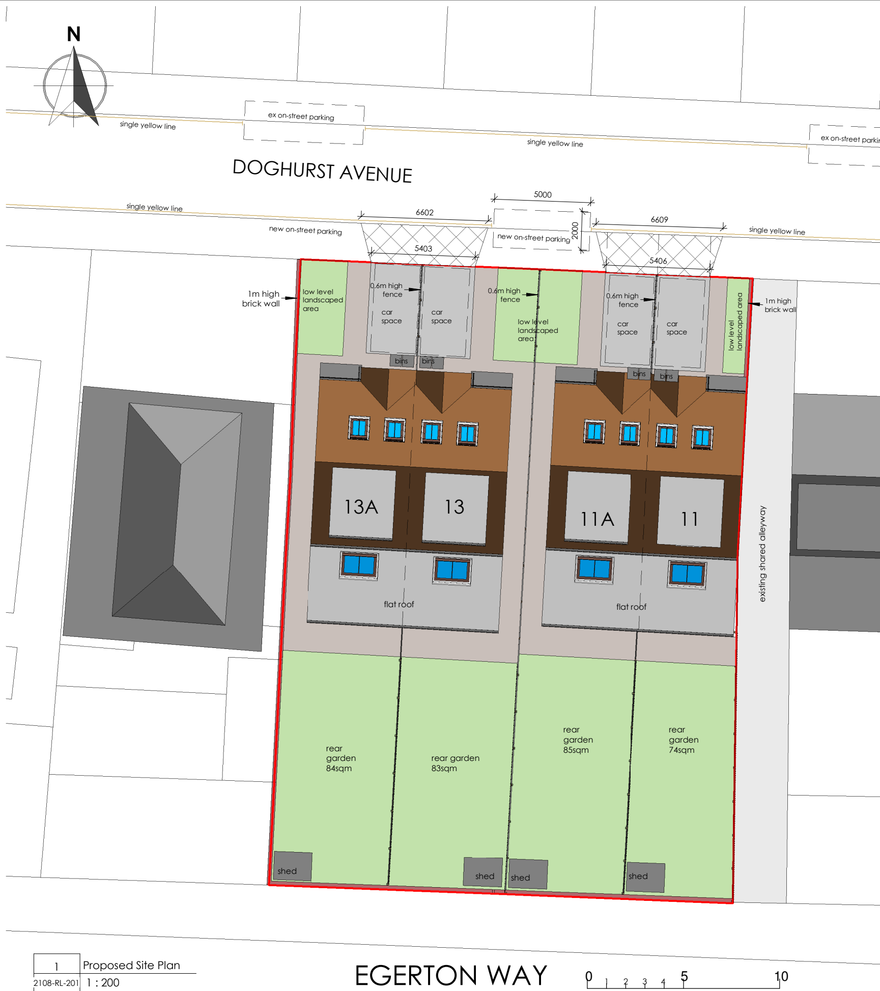
1 Proposed Site Plan 2108-RL-201 1 : 200