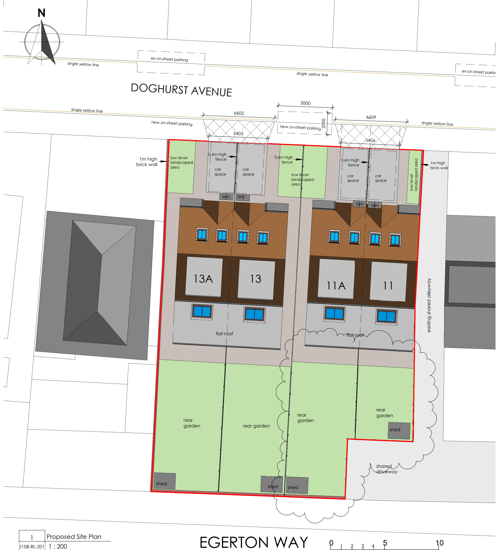
1 Proposed Site Plan 2108-RL-201 1 : 200