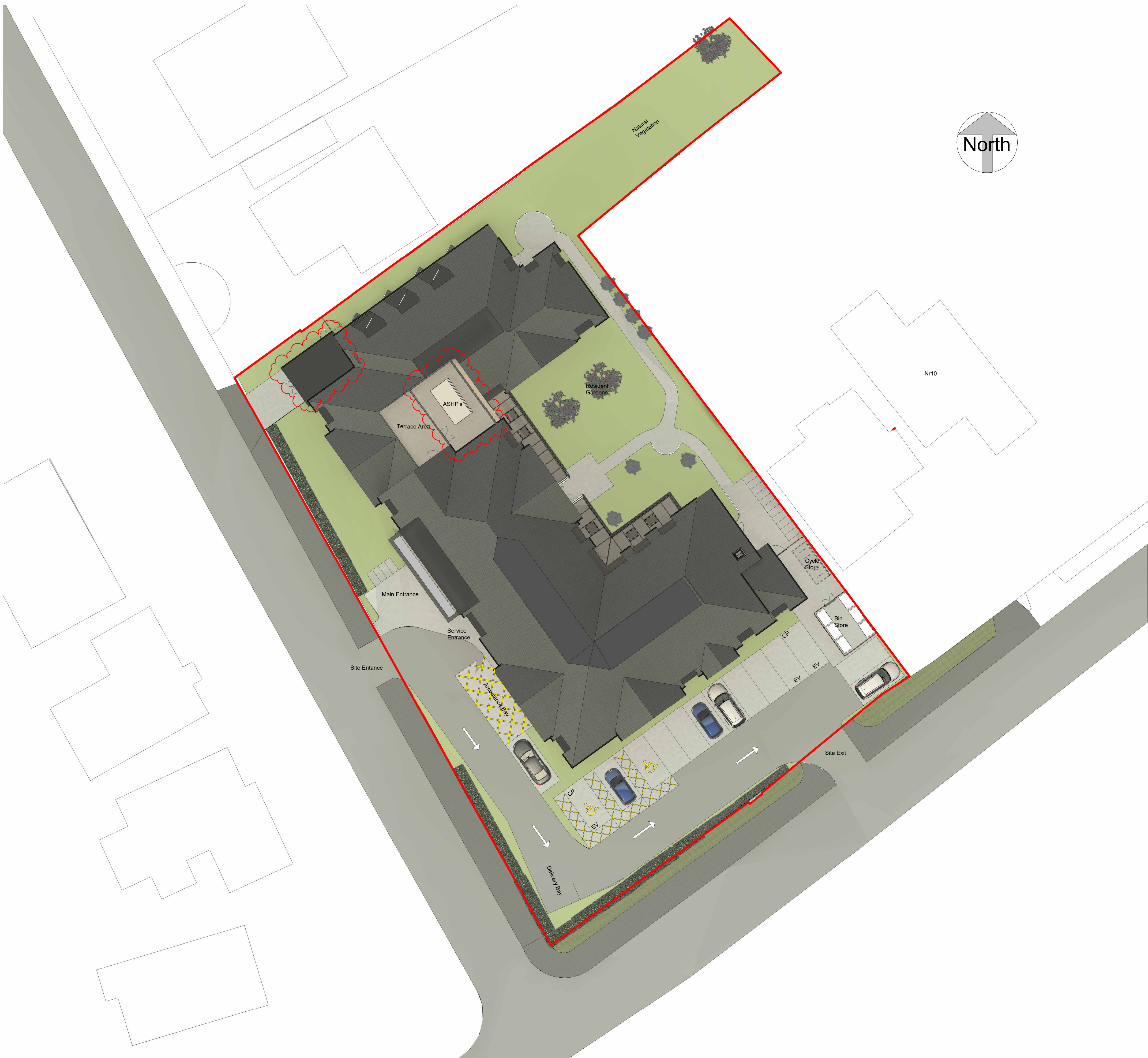
1 Site NMA 1 : 200