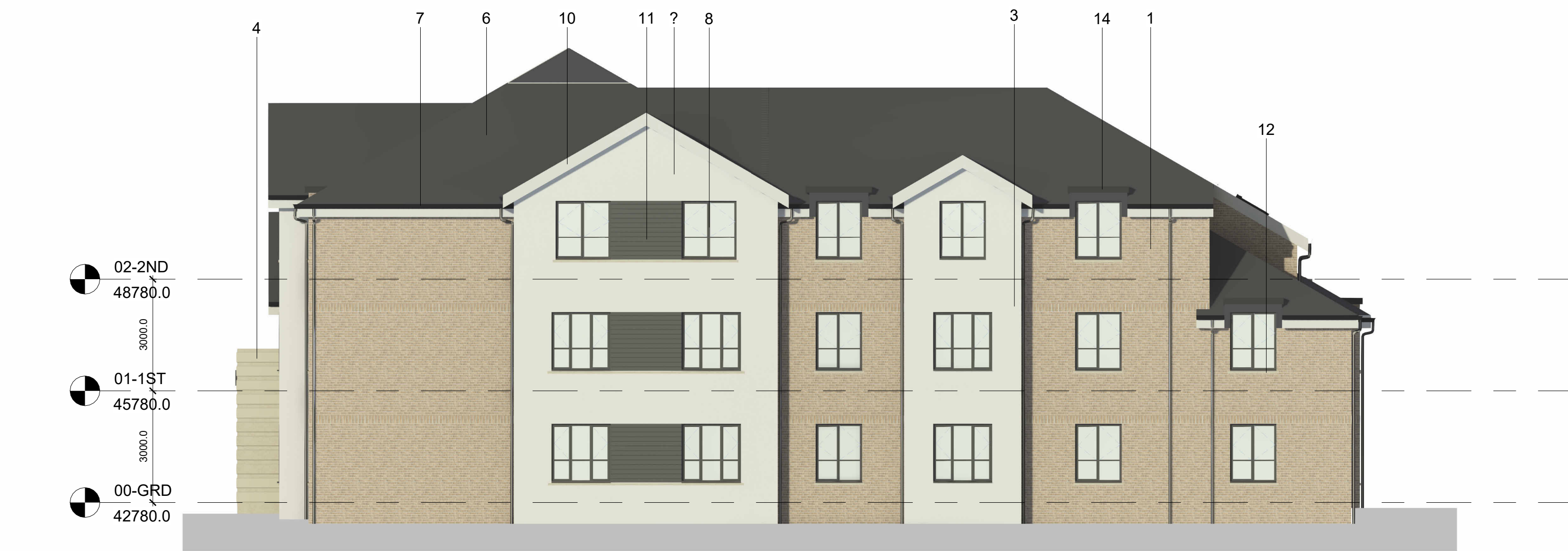
C - South - Planning 1 : 100