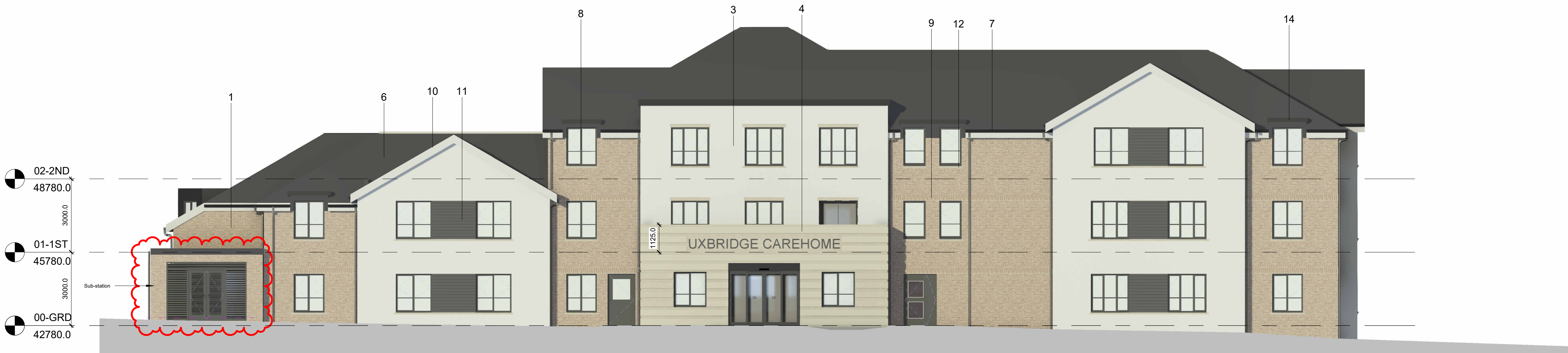
D - West - Planning 1 : 100