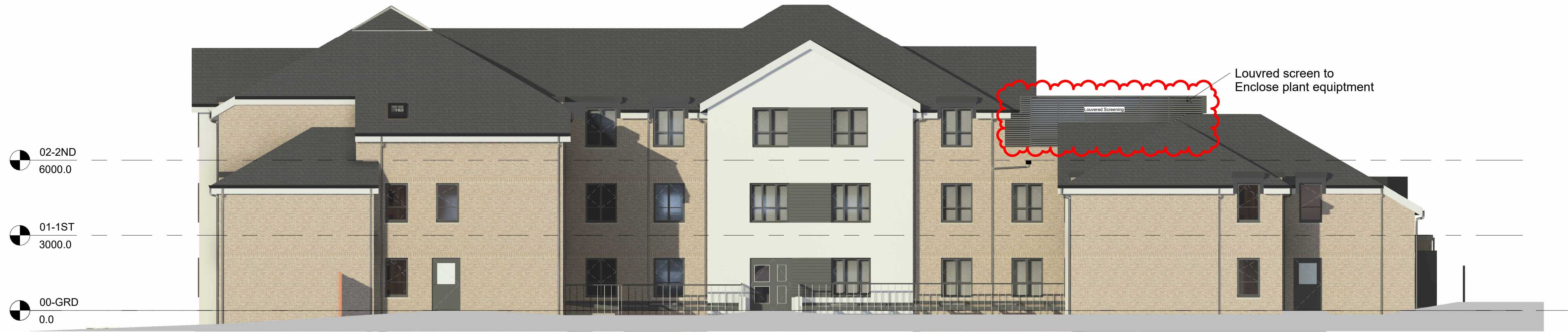
2 B - East NMA 1 : 100