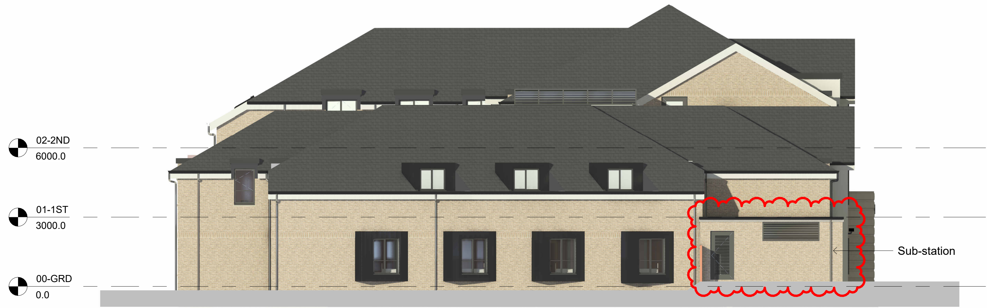
1 A - North NMA 1 : 100